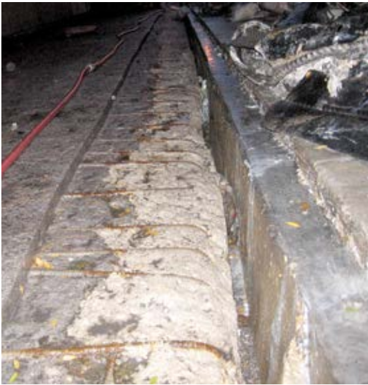
Example of deteriorated expansion joint