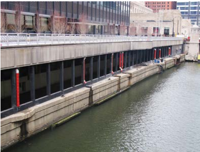
Intensive preplanning minimized interference with pedestrian movement and railroad operations

Debris removal was performed during off-peak traffic periods to minimize congestion. Due to weight limitation on the plaza deck, ready mix concrete truck access, as well as placement of site-batching plants, was restricted to roadways adjacent to the plazas, necessitating pumping the concrete to placement locations. Temporary holes were made through the plaza structure to allow shotcrete and pumping hoses to reach underside repair areas.