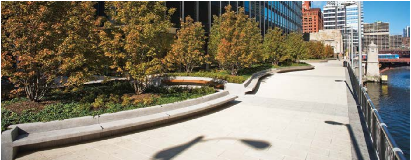
Final plaza includes curvilinear planter designs

Intensive preplanning with building management staff minimized contractor interference with pedestrian movement and normal facility operations. Planning and scheduling of debris removal and material deliveries with City of Chicago Department of Transportation and work over the railroad right-of-way with Amtrak personnel was also required.