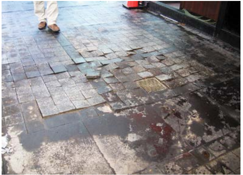
Poor drainage and improper slopes caused widespread deterioration

via reticulating lifts, as well as from within the plenum space, was completed in 2008. Concrete cores were taken for chloride, petrographic, and compressive strength analysis at representative locations to assess the durability and condition of the plaza structural slabs.