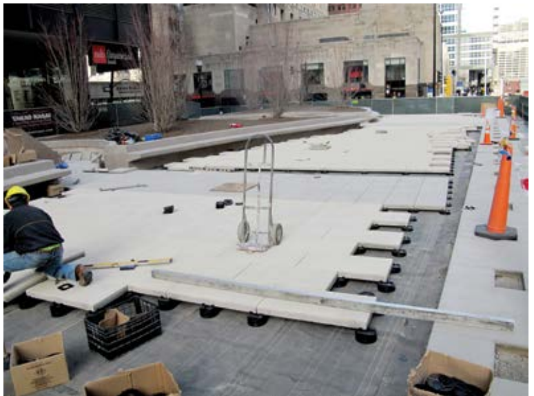
Precast concrete pavers on pedestal support system