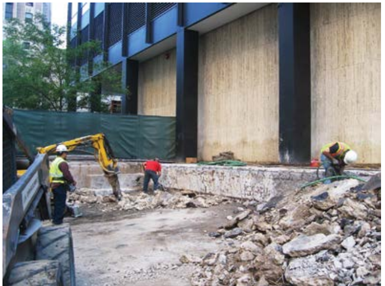
Repairs were designed with a removable concrete bulkhead

Precast concrete pavers on a pedestal support system were used to address difficulties in providing adequate surface drainage in limited-depth conditions and eliminate ponding on the surface.