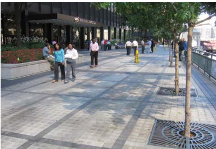
High pedestrian traffic called for multiple phasing of project