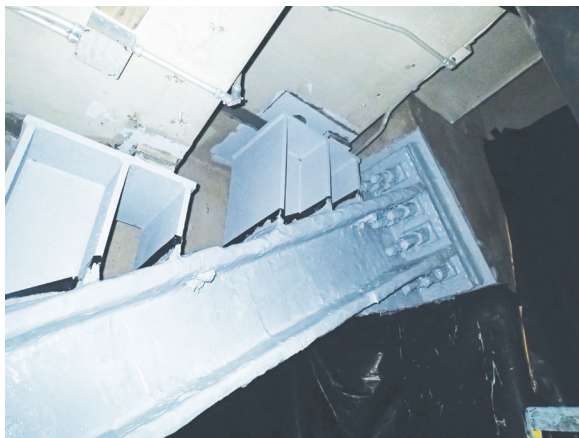
Fig. 6: Raker truss tieback anchor connection—completed repair with epoxy intumescent fireproofing to achieve 3-hour fire rating and provide corrosion protection to the beam and threaded rebar anchors.

high-strength threaded rebar. Sixteen threaded anchor rods are embedded into concrete columns and raker beams to transfer the 200,000 lb (90,720 kg) tension force from the steel raker truss to the concrete. The raker truss and tieback connections are concealed in a small inaccessible “dead space,” with leaking precast caulk/building-expansion joints directly above. Spray-applied fireproofing absorbed moisture, never drying out, causing severe corrosion.