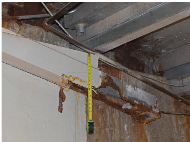
Fig. 2: Bottom side of seating riser at support—seating riser bearings and seismic restraint plates are visible on the bottom side. Moisture penetration through building expansion joint into mineral wool (each side of L-shaped plate) resulted in severe corrosion. Rain gutter system completely corroded through as it enters uninhabited space.

Large cantilevered steel raker trusses support the first 11 rows of seating at the Upper Concourse and are connected to concrete columns with