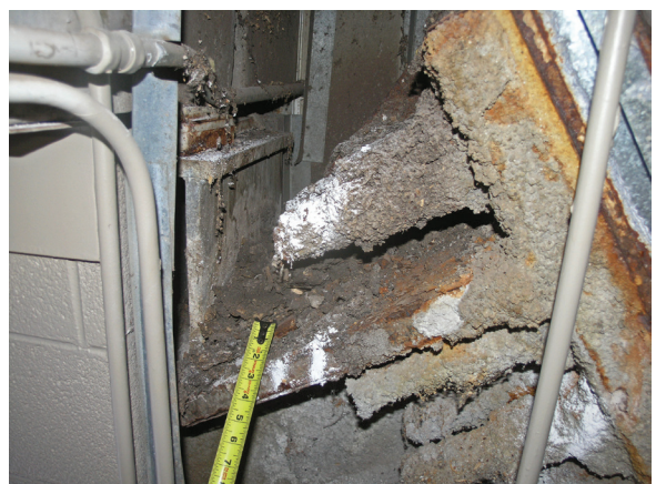
Fig. 5: Threaded rebar anchor—large mound at end of tape measure is peanut shells and debris washed through failed joint above.