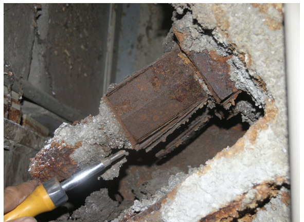
Fig. 4: Threaded rebar anchor nut—Severe deterioration of the nut. Corrosion of the threaded anchor rod is not visible due to fireproofing and debris.