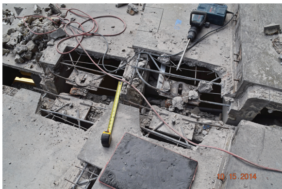
Fig. 8: Typical Precast Joint Repairs—Water leaking through building expansion joint between precast seating sections was absorbed by mineral wool fireproofing in the joint, resulting in severe deterioration. Large steel plates are seismic restraints.

This project consists of over $16,000,000 in repairs performed to the most severely deteriorated portions at Chase Field over the last 6 years. Although repairs were performed during the baseball off-season (October-March), each year events that occur during the construction schedule that required the work be completed/put back together/cleaned-up for the event, only to be torn apart the next day, resulting in mini-phases which had to be completed prior to the event. Repairs are anticipated to continue in upcoming years. ■