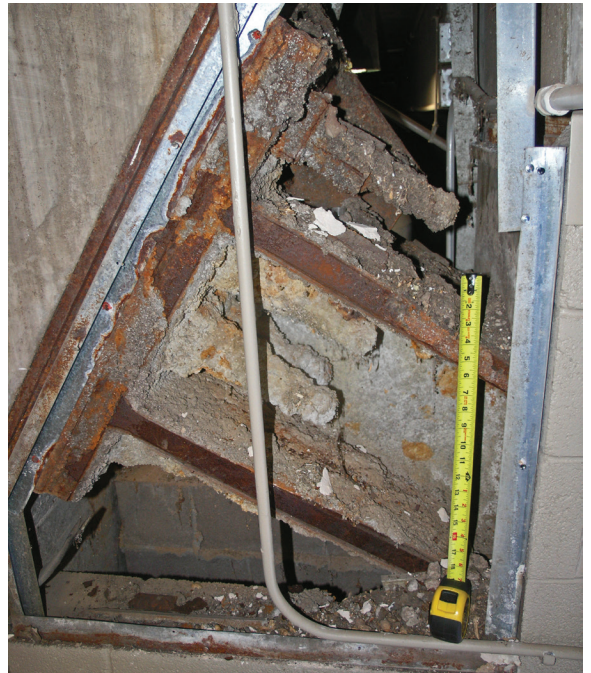
Fig. 3: Raker truss tieback anchor—connection between steel raker truss and concrete frame with sixteen 1-3/8" (35mm) diameter high strength threaded rebar anchor rods. Connection is completely hidden between two masonry walls in a dead space with leaking precast joint directly above. Spray-applied fireproofing absorbs water and never dries out.