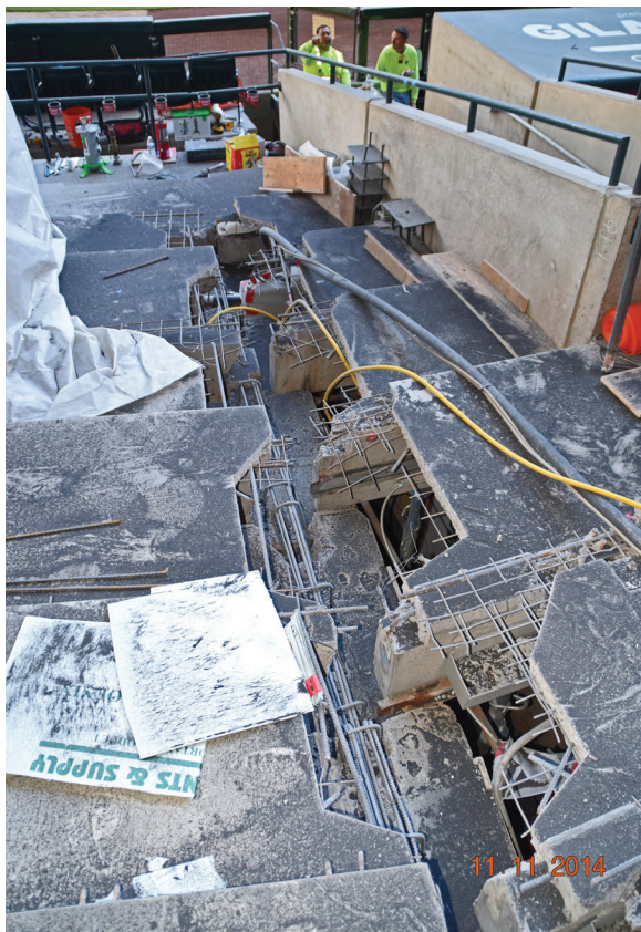
Fig. 7: Precast joint repairs—typical example of demolition required to repair the joints between the precast seating sections. Seismic restraint plates have been completely removed for replacement. Bearing repairs for stems have not started. Nearly every row was affected.

The upper seating level has 32 tieback connections. All locations were investigated, prioritized, and 19 locations have been repaired. None of the anchor rods had experienced enough corrosion yet that repairs were required to restore the rod’s tensile strength. Severely corroded nuts required replacement.