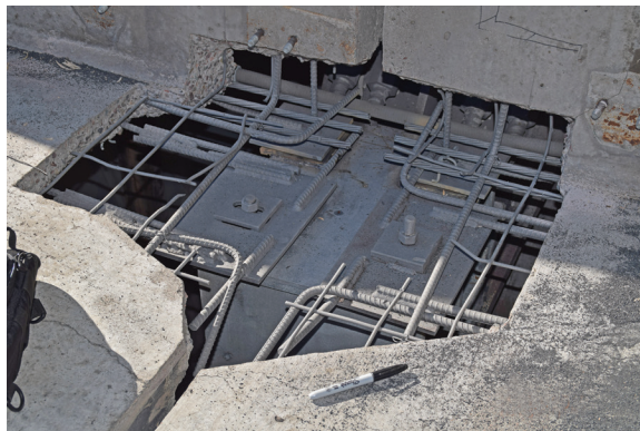
Fig. 9: Typical precast joint repairs—seismic restraint plate (embed with bolt) and precast bearing seat assembly (below prestressing strands) after existing plates replaced, rebar welded back, and sandblasted prior to epoxy coating and pour back.