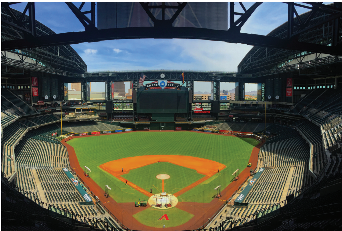
Fig. 1: Interior view of Chase Field

C hase Field (f.k.a. Bank One Ballpark) is located in Phoenix, Arizona, with a seating capacity of 48,633, and is home to the Arizona Diamondbacks Major League baseball team (Fig. 1). The stadium was constructed in 28 months and completed in 1998. The structural systems consist of reinforced concrete frames supporting concourses/seating areas, cantilevered steel raker trusses supporting overhanging seating areas, high strength threaded rebar tieback anchors connect steel raker trusses to the cast-in-place concrete frame, and precast prestressed concrete seating risers span between raker trusses or concrete raker beams/walls.