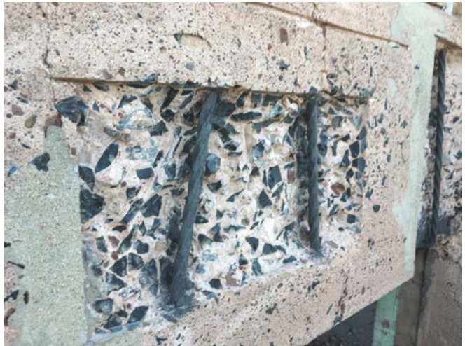
Fig. 5: Hand-applied repair

After the leveling coat, a waterproofing coating was installed for aesthetics and protection (Fig. 8). A coating with crack bridging was selected to coat the entire building façade. To meet the requirements of the historical commission, a textured base coat was selected to cover the blemishes and maintain some of the look of the old concrete. No less than twenty color samples were installed on the building as mock-ups for approval by the historical commission. The selected final color, Capitol Tan, also happened to be the first color that was installed as a sample.