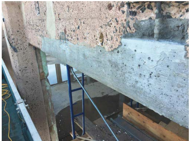
Fig. 6: Form and pour repair