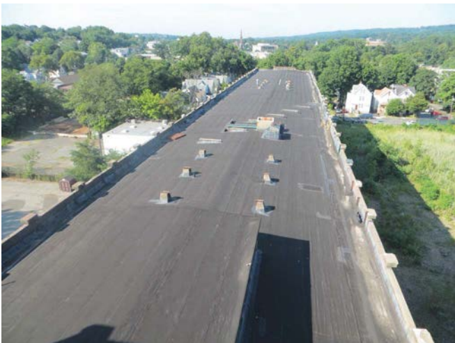
Fig. 10: Roof of the Edison Battery Building before construction