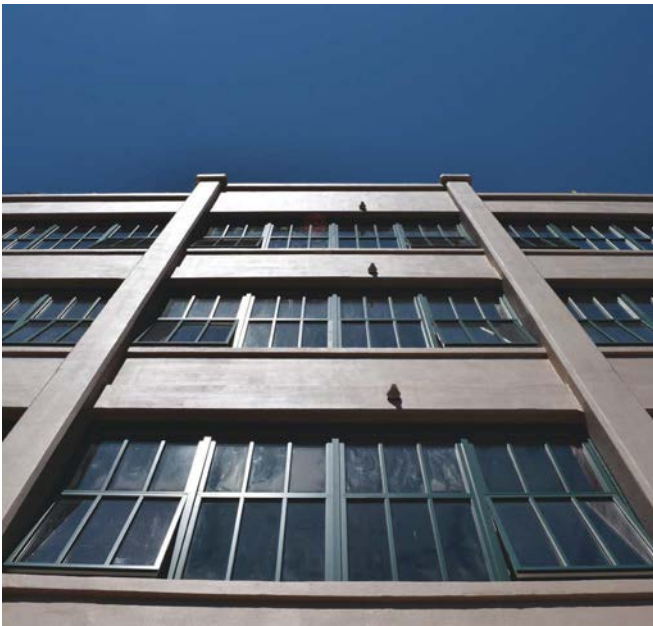
Fig. 9: New windows on building

For quality assurance, a third-party oversight consulting firm was engaged to keep track of progress and make recommendations to the project team on unforeseen conditions during repair. This control helped deliver quality repairs with recommendations that were adequate for non-standard details. This iconic structure was restored in 30 months and completed on time and on budget (Fig. 11).