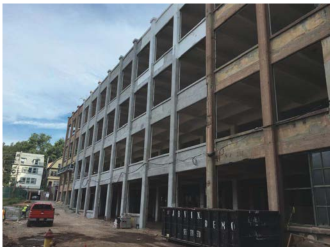
Fig. 7: Section of the building that received a parge coat