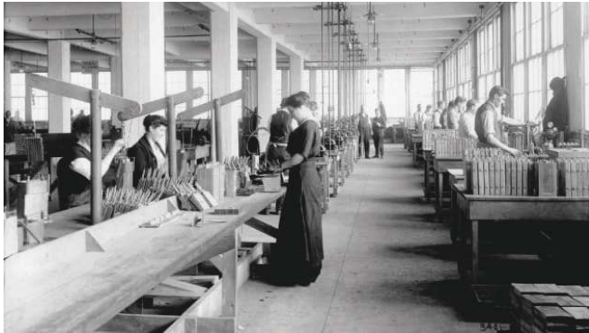
Fig. 2: Inside the Edison Battery Building