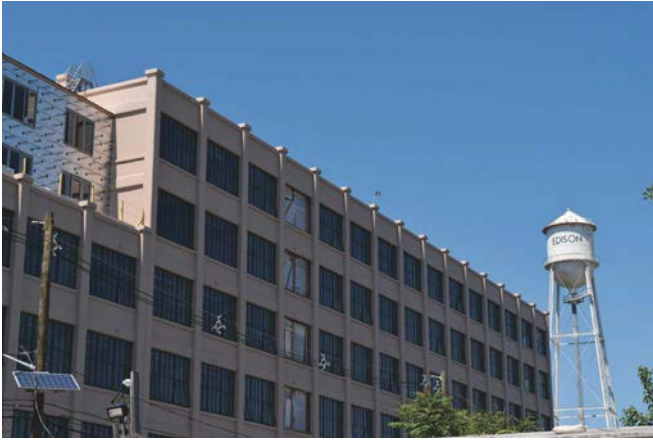
Fig. 8: Finished exterior with the iconic Edison water tower in the background