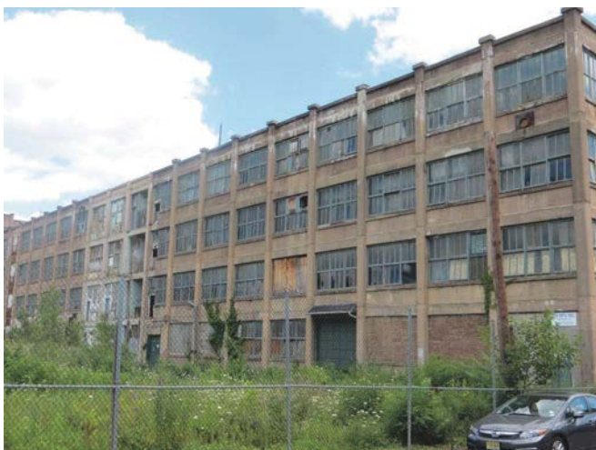
Fig. 4: Existing building façade prior to repairs

The complex has 14 ft (4.3 m) and 16 ft (4.9 m) ceiling heights with thousands of openings consisting of “oversized” multi-panel industrial windows. The pinkish-tan structure is utilitarian in nature, made of unadorned reinforced concrete with column and beam construction. The lack of ornamentation reinforces the mass and solidity of the building. The longest façade stretches 635 ft (194 m) and the columns are evenly spaced at 15 ft (4.6 m) on center.