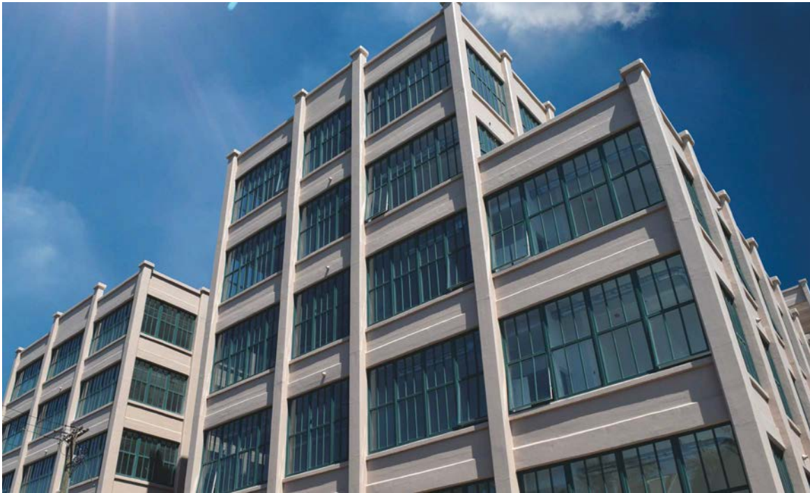
The Edison Battery Building

WEST ORANGE, NJ SUBMITTED BY SIKA CORPORATION