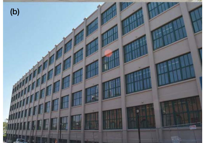
Fig. 11: The Edison Battery Building before repairs (a) and after repairs (b)