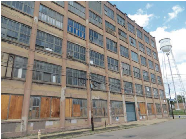
Fig. 3: From an iconic structure to a dilapidated building