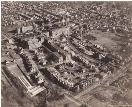
Fig. 1: Edison's industrial empire in West Orange, NJ

industrial complex and were the defining buildings in the town from the 1880s to 1970s. This industrial complex comprised of four buildings became the epicenter of industrial development at the turn of the century. It is also remembered as the mainstay for Thomas Alva Edison's activities as one of the greatest American inventors and marketer of his self-created new technologies and inventions.