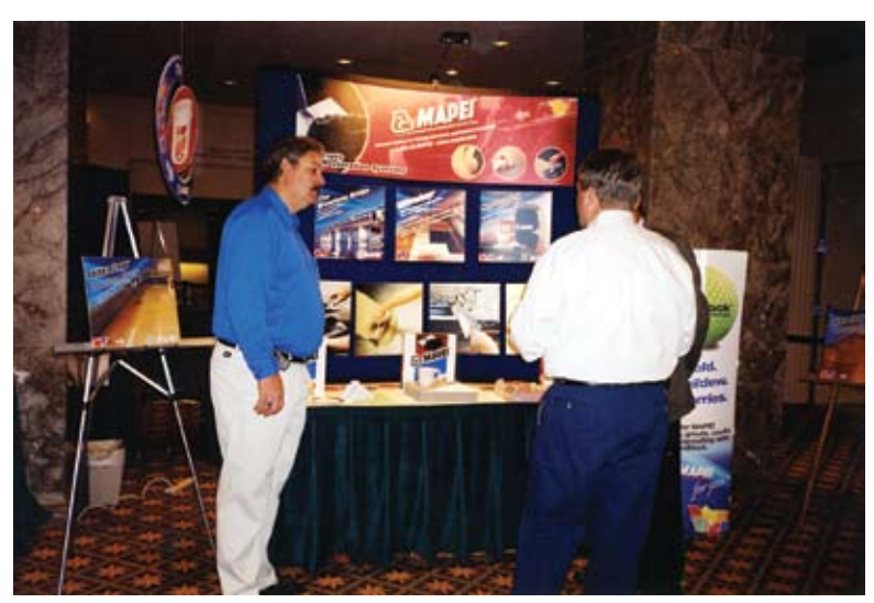
Visiting the exhibits at the Welcoming Reception

The high enthusiasm and strong attendance also spilled over into ICRI Committee meetings and Technical Sessions. Many of the Technical Committees made great progress on the documents they are working on, and several new projects were put into development as well.