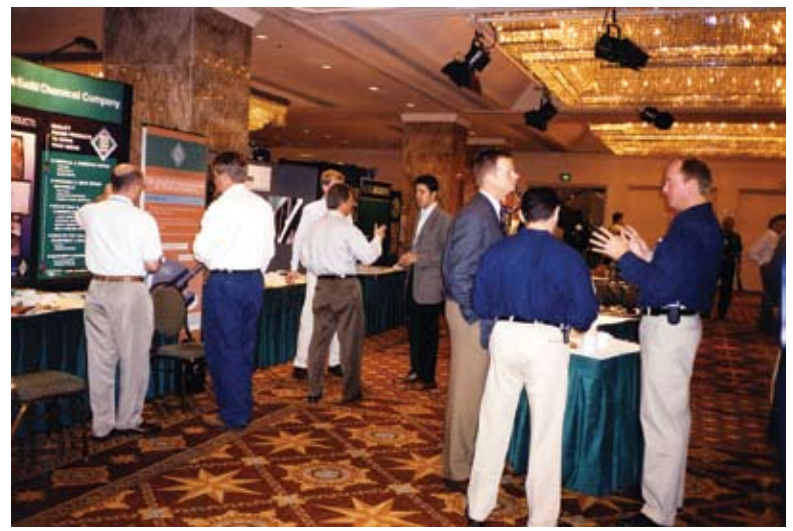
The Welcoming Reception provides plenty of opportunity for networking and visiting with friends