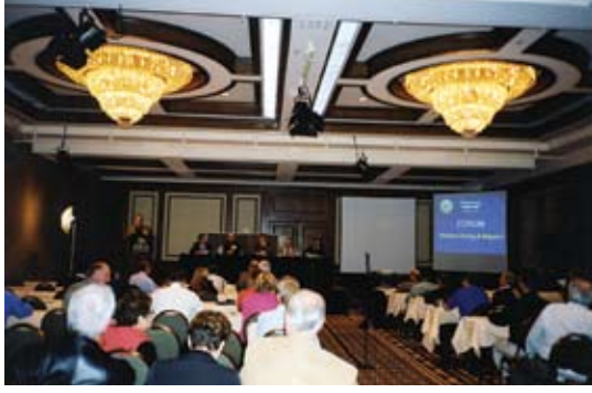
Friday afternoon's Industry Forum Panel Discussion, "Moisture Testing and Mitigation," was well-attended

As you can see, ICRI conventions are full of interesting activities, and many lively networking opportunities. We hope to see you all at the 2005 Spring Convention, to be held at The Boston Park Plaza Hotel, Boston, Massachusetts, March 3-4, 2005 (see page 7 for brochure).