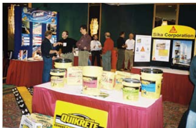
This year's convention included a record 38 exhibitors displaying their newest products and services to attendees

Committee to recruit a wide variety of the finest concrete repair professionals the industry has to offer. They shared their experiences, case studies, and demos, giving attendees a unique glimpse into what the brightest repair minds in the world have to offer the industry. A record number of attendees were on hand, so we were thrilled to have some extra room available for more bodies and more chairs. The full field of 14 presentations earned high praise and accolades from everyone.