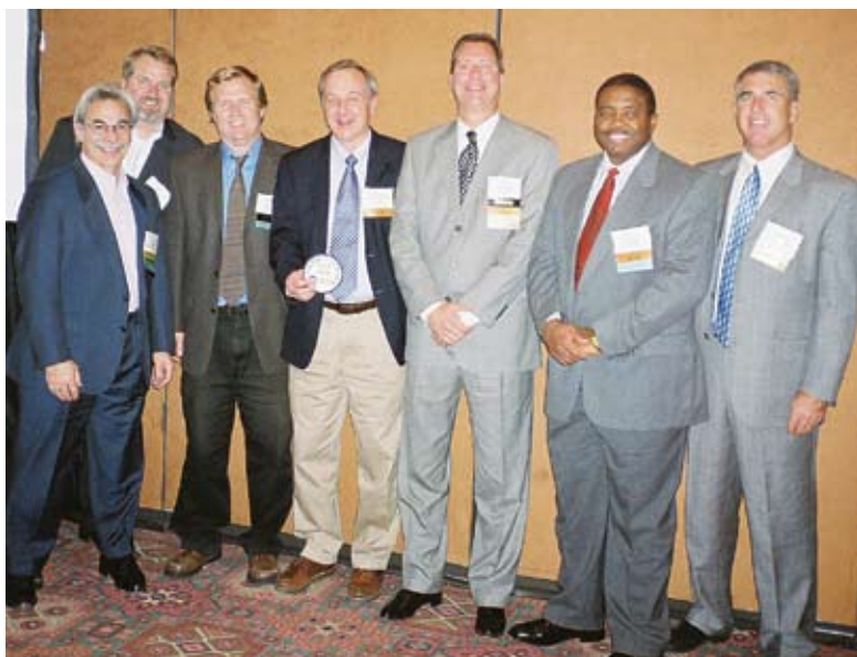
Members of the Baltimore-Washington Chapter proudly accepted the 2006 Chapter of the Year Award patch