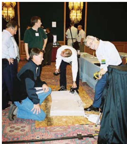
Several hands-on demonstrations were among the highlights of the technical presentations