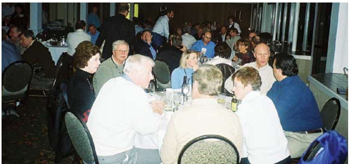
The Rocky Mountain Social Outing at Mount Vernon