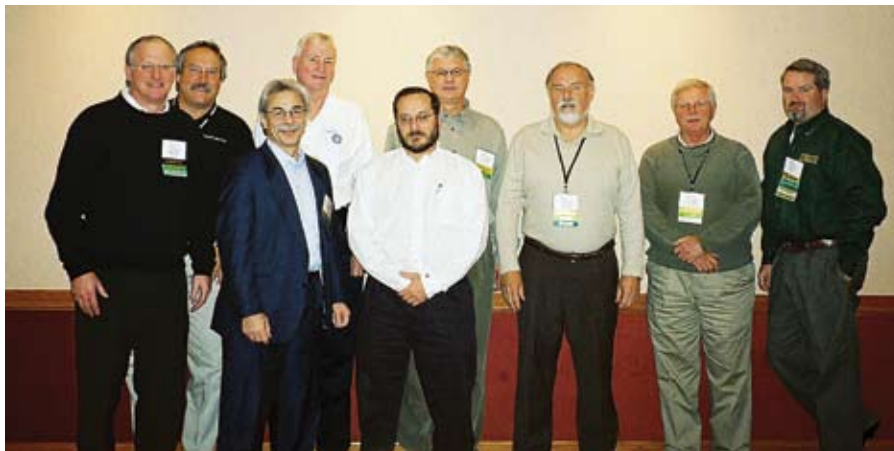
Nine Past Presidents of ICRI attended this convention

The convention was capped off Friday evening by the Rocky Mountain Chapter reception. The Mount Vernon Country Club was the setting and all of Denver was the backdrop from high up in the mountains. Local flavor was all around with the view, some great area food selections (including Rocky Mountain oysters), and a lively band of local entertainers.