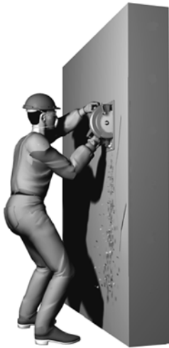
Fig. 3—Edge conditioning.

3. Treatment of exposed reinforcement —Bond-inhibiting corrosion should be removed from the reinforcing steel by an abrasive blasting wire wheel or needle scaler. If the cross-sectional area of the reinforcing steel has been significantly reduced, a structural engineer should be consulted. If a reinforcing steel coating has been specified, apply the coating after the reinforcing steel has been cleaned (Fig. 6).