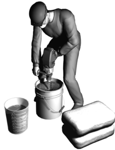
Fig. 7—Typical equipment to mix materials.

the inner ear to limits that are specified by the United States Occupational Safety and Health Administration (OSHA); and