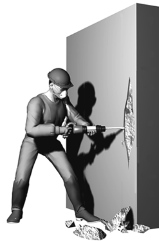
Fig. 2—Bulk concrete removal.

1. Bulk concrete removal and edge conditioning — Loose, delaminated concrete should be removed until the substrate consists of sound concrete (Fig. 2). Where corrosion of the reinforcement exists, continue bulk removal along the reinforcing steel and adjacent areas with evidence of corrosion-induced damage that would inhibit bonding of repair materials. Bulk concrete removal should include undercutting the corroded reinforcing steel by approximately 3/4 in. (19 mm). The shape of the prepared cavity should be kept as simple as possible—generally square or rectangular in shape. The edges of the patches should be sawcut perpendicular to the surface to a depth of 1/2 in. (13 mm) to avoid feather edging the repair material (Fig. 3).