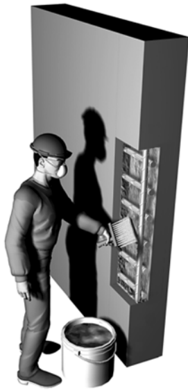
Fig. 6—Treatment of exposed reinforcement.

time (or maximum moisture content) with the sealer or coating manufacturer before application commences. For more information, consult ACI 515.1R, “Guide to Use of Waterproofing, Dampproofing, Protective, and Decorative Barrier Systems for Concrete.”