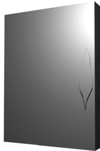
Fig. 1—Concrete delamination.

The recommended steps in properly preparing the surface to receive a hand-applied mortar are as follows: