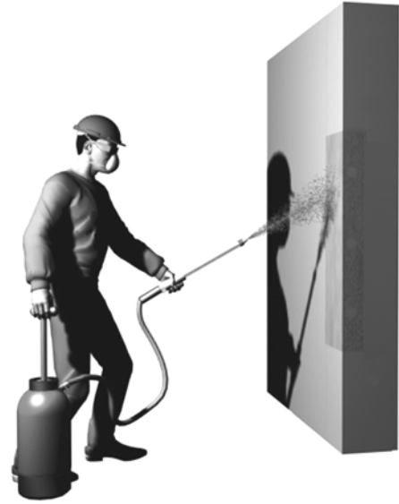
Fig. 9—Spray application of curing compound.