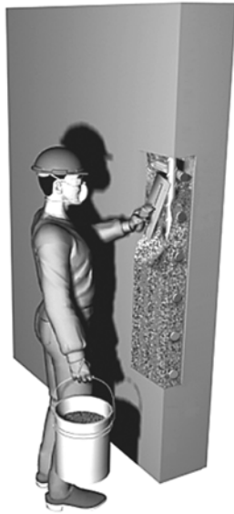
Fig. 8—Hand application of repair material.