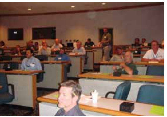
The Technical Sessions at each convention are always jam-packed with attendees and topical information