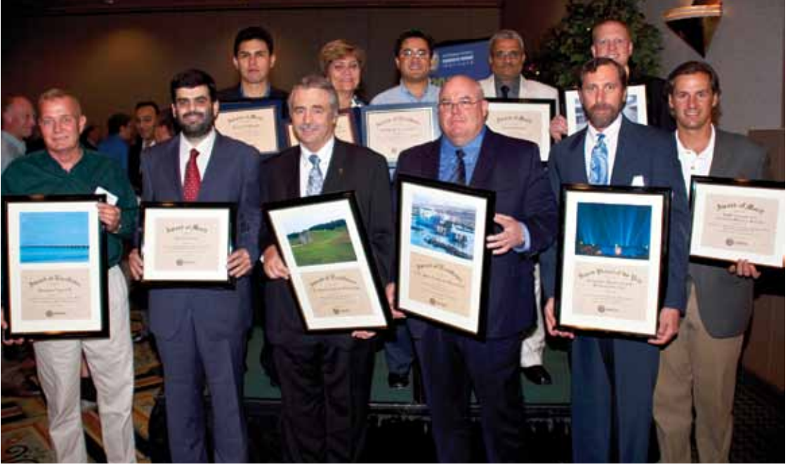
A group of winners from the 22 projects honored at the 2009 Project Awards ceremony