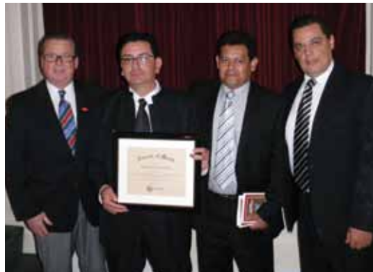
Members of the BASF delegation from Mexico proudly display their Award of Merit