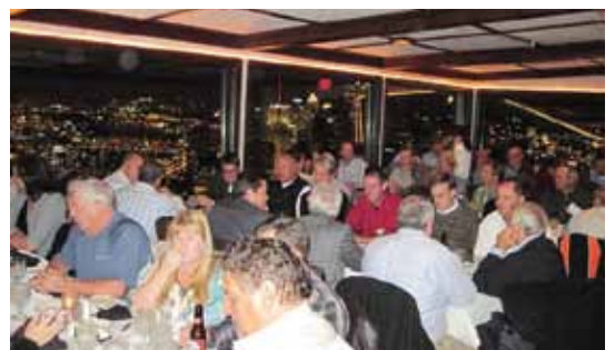
The Georgetown Inn offered great food and fantastic views of the Pittsburgh skyline