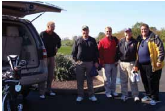
The weather could have been better, but ICRI golfers rarely miss an opportunity to get together out on the links

The official start of any convention is the Welcome Reception. Attendees gathered on Wednesday evening, surrounded by a fine array of local and national exhibitors and meeting up with industry professionals from all over the world. Our local hosts, the Pittsburgh Chapter, managed to slip in a golf outing that morning for those who could not do without a tee time before face time with old friends and new contacts alike.