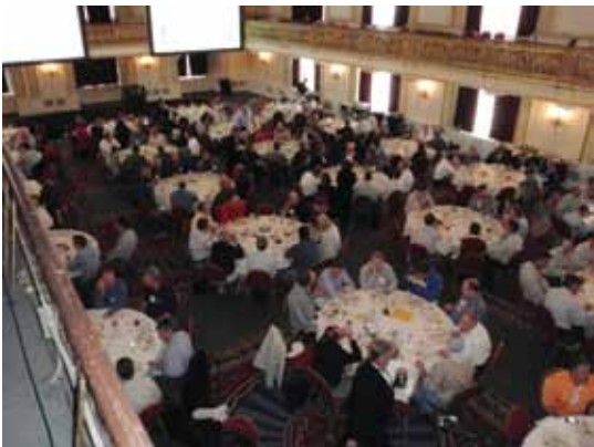
The banquet room at the Omni added a historical ambiance to the Thursday Opening Luncheon