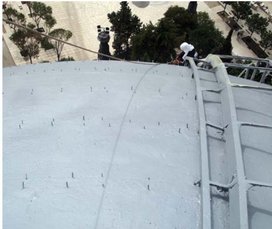
Waterproofing application of the cupola

In addition to the exterior repairs and waterproofing, the interior of the cupola received a cement-based acrylic coating and the joints were