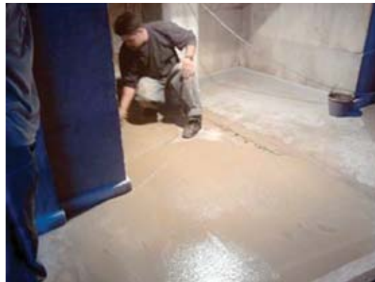
Leveling slopes with premix mortar