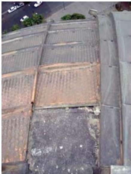
Copper roof cover removal

The structure suffered from long-term exposure to pollution in Mexico City. Furthermore, since