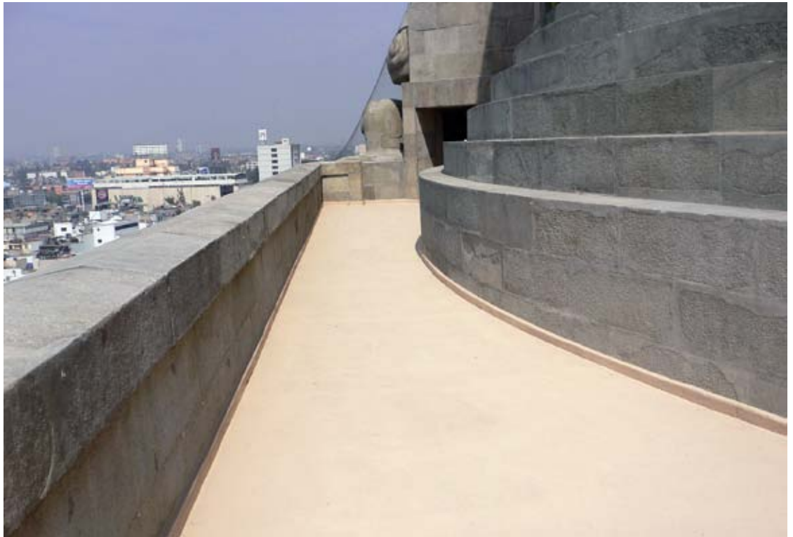
Waterproofing membrane on observation deck

sealed with a polyurethane asphalt-modified sealant. The copper plates that were removed were cleaned and polished before being reinstalled on the roof of the cupola.