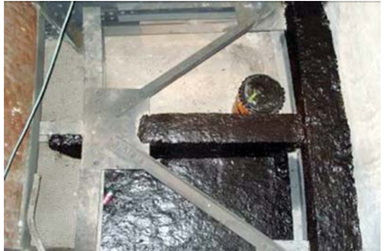
Waterproofing cupola's interior

A renovation of this historic landmark was planned to restore the structure to its original splendor in time for the 2010 centennial celebration of the Mexican Revolution. The current mayor of Mexico City, Marcelo Ebrard, was scheduled to officially reopen the Monumento a la Revolución on November 20, 2010, during the centennial celebration. Thus, the repairs to the building had to be conducted quickly to meet this strict deadline.