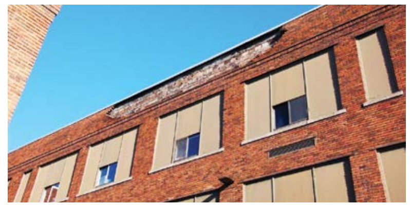
Fig. 1: Brick veneer failure at upper parapet wall of an elementary school, which occurred while school was in session

Moisture intrusion, negative—Many buildings have been found to have a negative vacuum at the interior of the building. This is common due to an imbalance in mechanical systems. The building shown in Fig. 2 has a severe negative vacuum at the interior. Thus, moisture is being pulled through building weeps and other void spaces within the veneer,