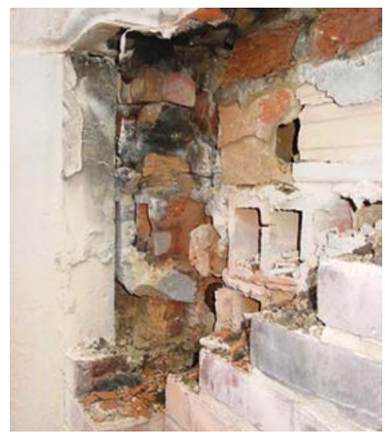
Fig. 3: Materials of different behavioral properties, including cast stone, clay brick, sand lime brick, terra-cotta tile, and polyurethane joint sealants. Previous leakage through joint sealants has caused deterioration of the brick

Penetrating sealer applications—Penetrating sealers have commonly been applied to the exterior façade to reduce moisture infiltration and theoretically reduce the veneer deterioration. These materials have often been the cause of further accelerated deterioration of the mortar behind the sealer due to the inability for moisture to escape. Any moisture that has found