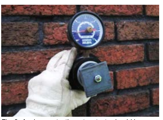
Fig. 8: Anchorage testing—two tests should be performed: one on the backup material and another on the brick or mortar at the exterior veneer surface. Without these two independent tests, verification of the veneer holding system is inadequate

Short-term immediate needs for life safety— There are times when buildings are reviewed and immediate concerns are discovered that should be