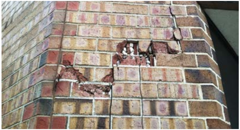
Fig. 2: Above this vertical shear in the brick masonry, 200 ft (61 m) of jumbo brick wall moved both vertically and horizontally, requiring immediate shoring and investigation for permanent repairs

which has resulted in deterioration. The deterioration is a result of freezing-and-thawing where water has been trapped within the veneer.