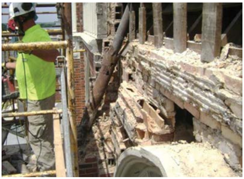
Fig. 7: 1920 construction consisted of a variety of load-bearing materials including cast stone, hard- and low-fired brick, terra-cotta tile, steel, hard dense pointing mortar, and lime sand mortar