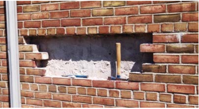
Fig. 6: Destructive removals of the veneer system found that the backup structural block system was parge-coated during construction for waterproof integrity. The tie brick was actually inserted into the block wall system