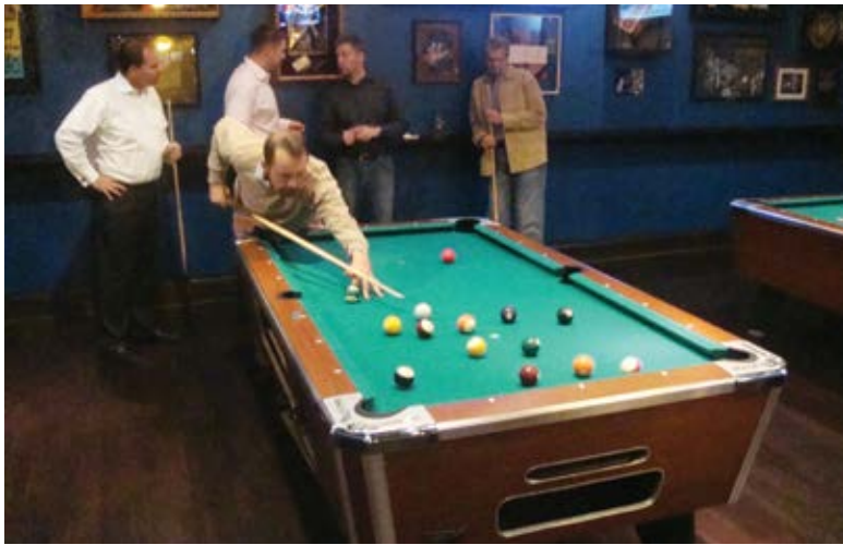
Friday evening's event at Buddy Guy's Legends included food, friends, and some pool