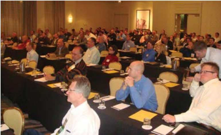
The Technical Sessions, 15 in total, always bring attendees a good return on investment

The annual Project Awards Banquet is a highlight of any fall convention, and this one was no exception. The Awards Committee livened things up by welcoming attendees with paparazzi taking photos on the red carpet! The entries this year were all terrific, and the Florida-based judging panel did a great job reviewing the submissions. We offer a special thanks and congratulations to those ICRI Project Award recipients for all of their hard work.