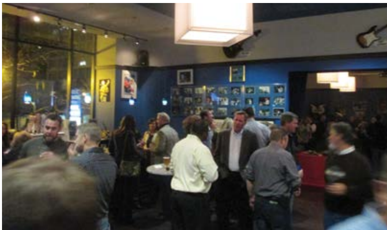
Convention attendees welcomed a chance to unwind and let loose at the venerable South Loop music venue

The convention ended on a high note with a social event sponsored by the Chicago Chapter, an evening at Buddy Guy's Legends. Chicago is famous for the blues and there is no better place in Chicago for blues than Buddy Guy's Legends in the heart of the South Loop. Old friends and new had a fantastic dinner, great drinks, and an opportunity to listen to some of the music for which Chicago is known.