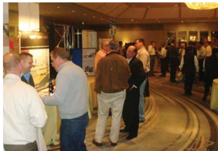
Networking is the name of the game at the reception, where exhibitors meet and greet as many attendees as they can