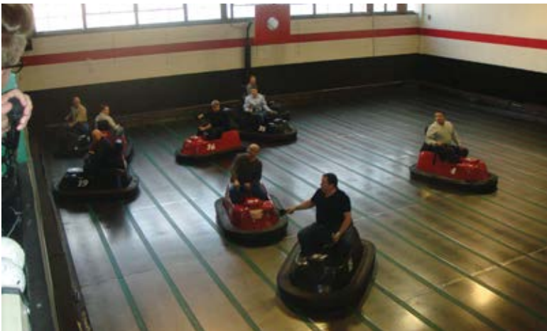
...but as you can tell, distractions from above were not out of the ordinary...