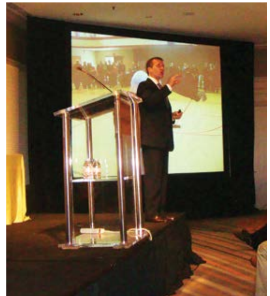
A Rhodes Scholar, Navy Seal, and White House Fellow, Eric Greitens has founded “The Mission Continues” to challenge veterans to continue to serve and inspire