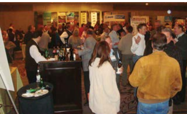
Each convention kicks off with the Welcome Reception, where members get to meet, get reintroduced, and socialize before the learning begins