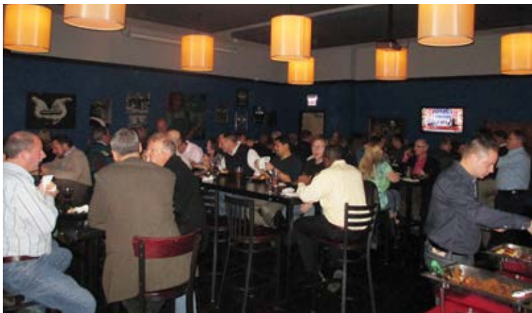
The Chicago Chapter planned and hosted this music-filled event, where some folks listened to the blues all night long