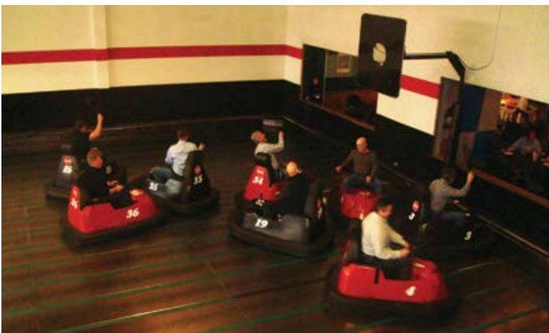
...and getting a whiffle ball into that little, teeny-tiny hole in the backboard was the ultimate goal. Did we mention the hole was tiny?

A beautiful venue, a couple of great chapter events, terrific technical presentations, a very moving general session speaker, and RECORD-BREAKING ATTENDANCE—these were just some of the highlights of ICRI's 2013 Fall Convention, held November 13-15 at the Fairmont Chicago, Millennium Park Hotel in Chicago, IL. Final attendance for the convention was 324, smashing our previous record of 289!