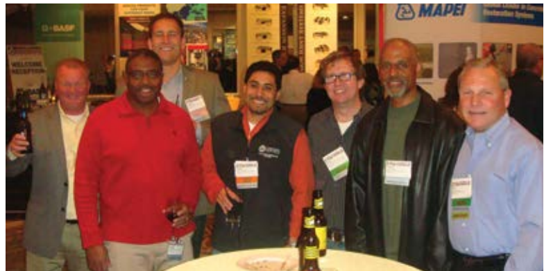
Always well-represented, the Baltimore-Washington gang even hangs out together at the reception

Thursday morning at the convention was busy as usual, beginning with the “Visit the Exhibits” Continental Breakfast, held in ICRI’s exhibit area. Attendees had another chance to learn about many new products and services offered by our exhibitors while enjoying a delicious breakfast. ICRI’s committee meetings, which seem to be busier every convention with the addition of new committees and subcommittees, also kicked off Thursday morning.