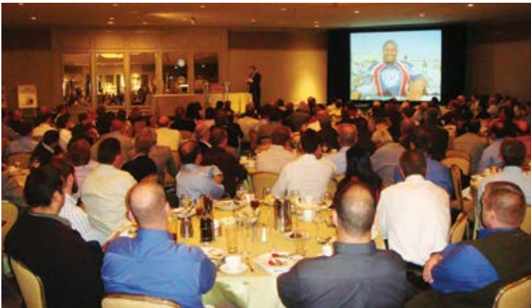
ICRI brought in Eric Greitens as a guest speaker for the Opening Luncheon and General Session. Eric’s heartwarming presentation was powerful and inspirational