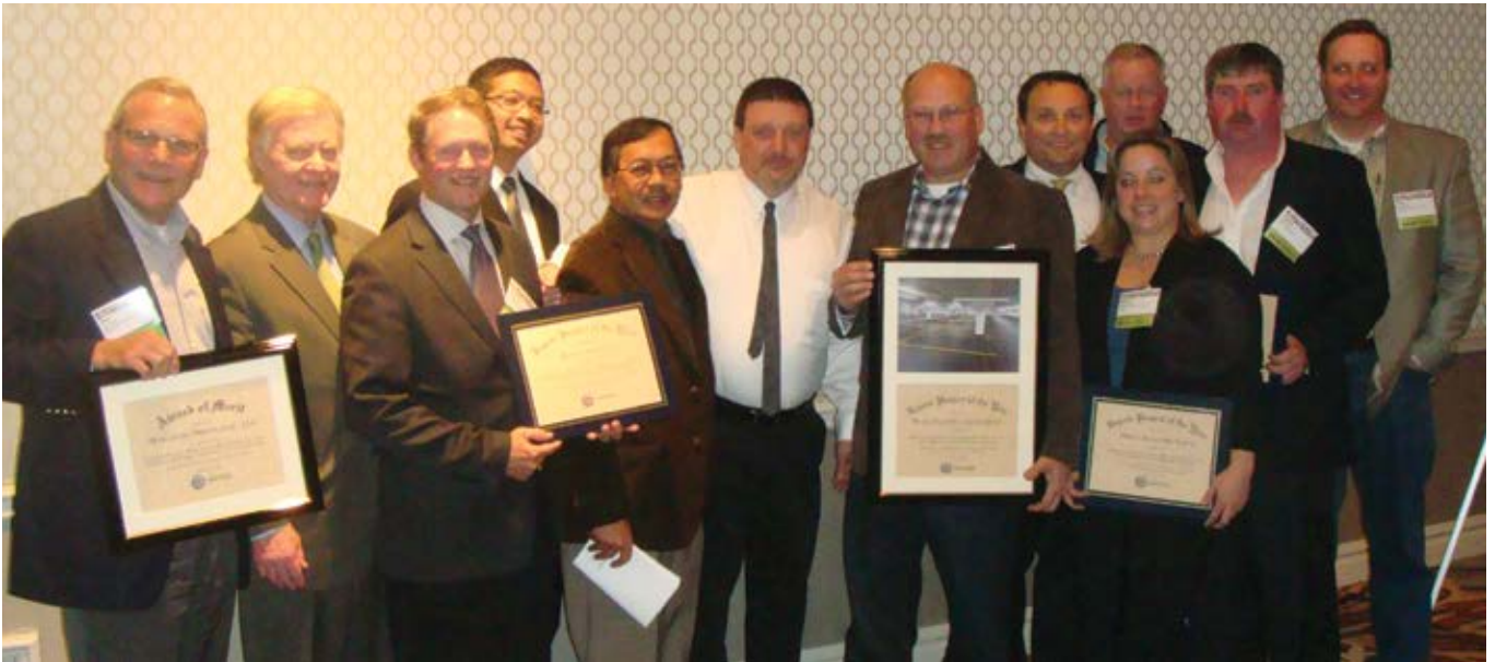
The 2013 Fall Convention included ICRI's 21st Annual Project Awards Banquet. Walsh Construction Company, located in Chicago, brought quite a crowd to the Project Awards Banquet to celebrate their Project of the Year honors for 2013