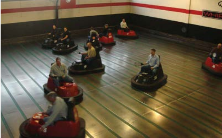
The action on the whirlyball court was fast-paced and fun...