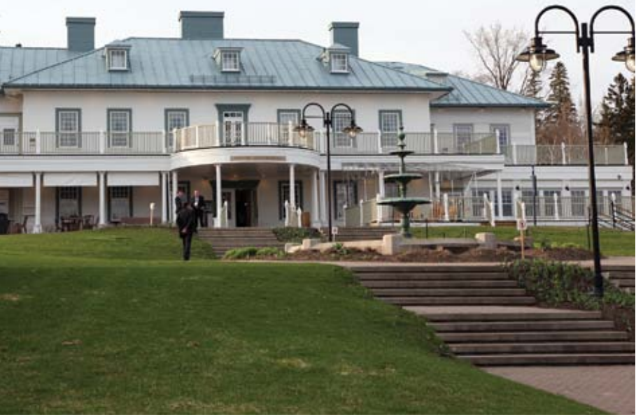
Manoir Montmorency, the site of the Québec Province Chapter social outing