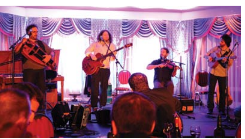
Le Vent du Nord, the evening's musical entertainment, had the ICRI crowd on its feet and applauding during the entire performance