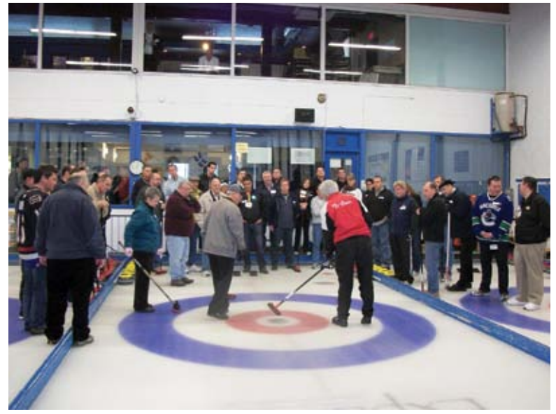
Because 97% of those participating had never been (or seen) curling before, the staff at the rink provided some excellent instruction