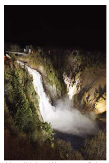
A beautiful shot of Montmorency Falls

Thursday's busy schedule concluded with a soldout evening of dining and entertainment at the beautiful and historic Manoir Montmorency overlooking Montmorency Falls and the St. Lawrence River. The Québec Province Chapter pulled out all the stops to host what turned out to be an outstanding evening of authentic local cuisine that ended with more than one standing ovation for the chapter's chosen entertainment: Le Vent du Nord. This utterly engaging and unique quartet of talented