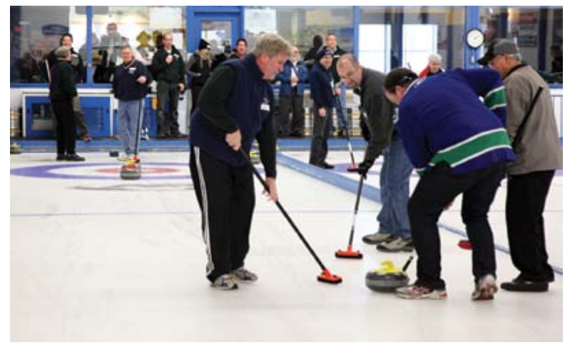
Members are seen "brushing" up on their curling technique

he picturesque beauty of the historic quarter of Québec City, QC, Canada, one of North America's oldest cities, served as the backdrop for the ICRI 2012 Spring Convention. Significant committee work, captivating technical sessions, engaging exhibitors, and our annual Recognition Luncheon were all a big part of our expanded 3-day event, held April 18 to 20 at the Hilton Québec.