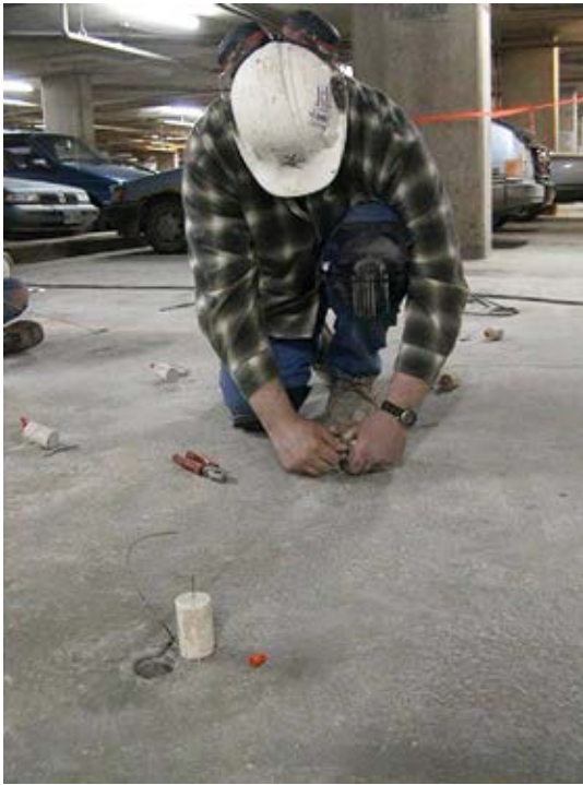
Fig. 8: Installation of zonal embedded galvanic anodes

anodes is one method that might address this risk. Half-cell mapping can identify those high-risk areas that may be related to minimal concrete cover and/or very high chloride concentrations. Once these at-risk areas are detected, galvanic anodes (Fig. 8) could be installed in the identified areas. A completed galvanic anode installation can be seen in Fig. 9.