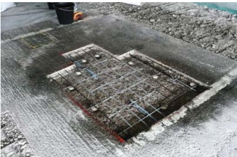
Fig. 6: Incorporation of galvanic anodes at periphery of patch

lized for up to 15 to 20 years, thereby improving durability and reducing maintenance. While this type of corrosion protection is a simple and commonly used technique, it only protects areas just outside of the repair area from incipient anode formation. Other high-risk undetected corrosion sites are not affected by this installation.