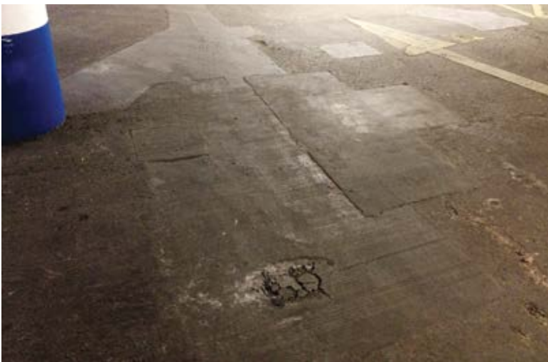
Fig. 5: Premature failure on car parks due to incipient anode formation