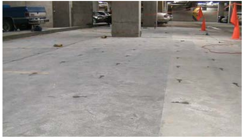
Fig. 9: Completed galvanic anode installation

Alkali-activated embedded galvanic anodes have been used to provide targeted corrosion control for multi-story car parks in the UK for more than a decade. Galvanic systems do have a finite life and in temperate climates such as the UK, they are likely to last in the region of 15 to 20 years. 8 Their holistic use with systems such as waterproofing membranes and properly placed high-quality concrete repair mortars provide a multi-faceted approach to controlling corrosion when aesthetic and safety improvements to parking structures are undertaken. Controlling corrosion may extend the service life of a parking structure and