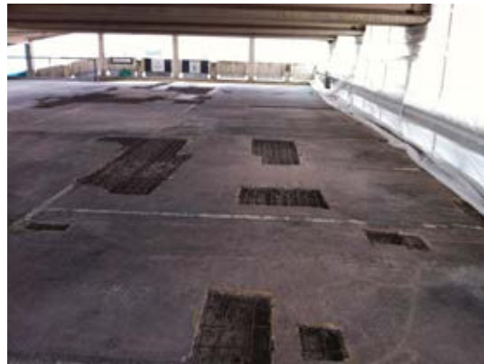
Fig. 3: Corroded areas prepared for patching

The risk of corrosion throughout a parking structure can vary greatly depending on the location and exposure conditions. In many cases, a single