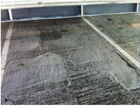
Fig. 1: Cosmetic surface patching