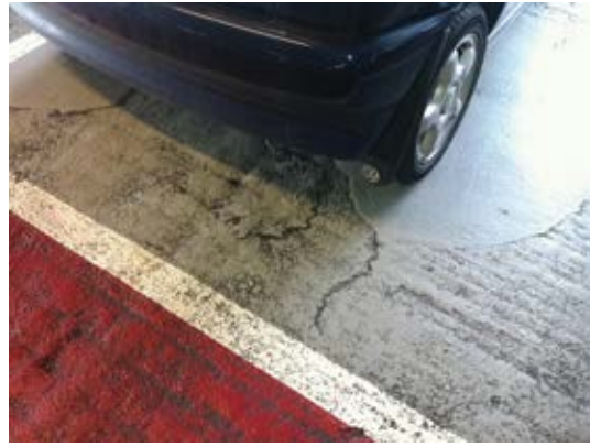
Fig. 2: Cracking and delamination

easily identified and accounted for by visual signs such as concrete spalling and delamination, other potential corrosion sites remain invisible to the naked eye and sample testing may not identify the hidden vulnerabilities.