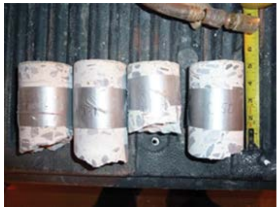
Fig. 3: Concrete cores for investigative testing

One of the larger issues discovered during the initial site visit was the excessive cracking at the midspan of numerous filigree beams. The subsequent investigative work was critical to properly assess the cause(s) of these excessive cracks. Cover