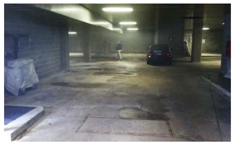
Fig. 2: Underground parking structure

long. However, as is the case in many situations in life, sometimes what seems so simple is easier said than done. Time slips away, money and resources get allocated to other needs, and suddenly you find yourself 10 to 20 years down the road and realize that the certain steps that should have been taken were not, and now the situation is more serious than it needed to be.