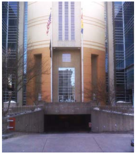
Fig. 1: Berks County Services Center office building with underground parking structure

any owners and consultants know that proactive maintenance on their facilities can help to dramatically reduce the headaches associated with the costs, time, and maintenance issues that will result from putting off maintenance for too