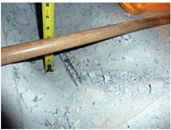
Fig. 5: Investigative test pit near column

meter readings and test pit excavations revealed that the top reinforcement at the beam supports was installed lower than designed, and in some cases, nearly 3 in. (75 mm) lower than designed. This condition reduced the beam's moment capacity at the supports, causing overstress to the beams at midspan. Refer to Fig. 6 for a visual aid to depict this phenomenon.