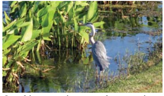
One of the spectacular scenes of nature on the LPGA golf course