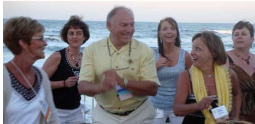
ICRI members and guests at the 20th Anniversary Party were lively on the dance floor all night long!