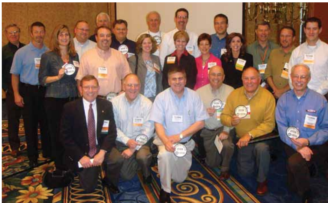
At the Spring Convention, ICRI honored its Chapters and had a record number receive the coveted Chapter Patches for Outstanding and Excellent Chapters