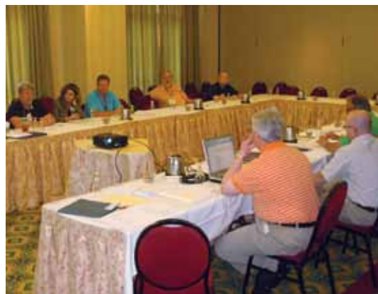
Starting Thursday morning, attendees participated in both technical and administrative committee meetings