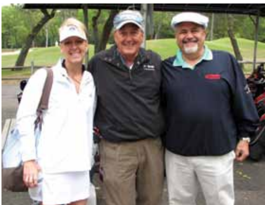
The weather was perfect for golf and the golfers were in a great mood