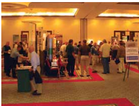
The Visit the Exhibits continental breakfast on Wednesday morning is the first opportunity for attendees to see what exhibitors have to offer

After that, the Carolinas Chapter welcomed a contingent of golfers to an outing at the beautiful