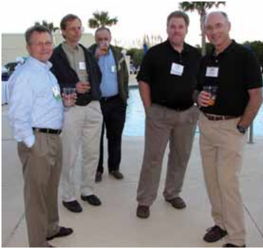
Friends gathered on the patio of the Ocean Club for an evening of food, fun, and music courtesy of the Carolinas Chapter

“Transportation Structures,” and you don’t want to miss the 2010 Project Awards Banquet and celebration. We are getting things done at ICRI and would like to extend an invitation for you to get involved. Make the most of your membership and come to a convention.