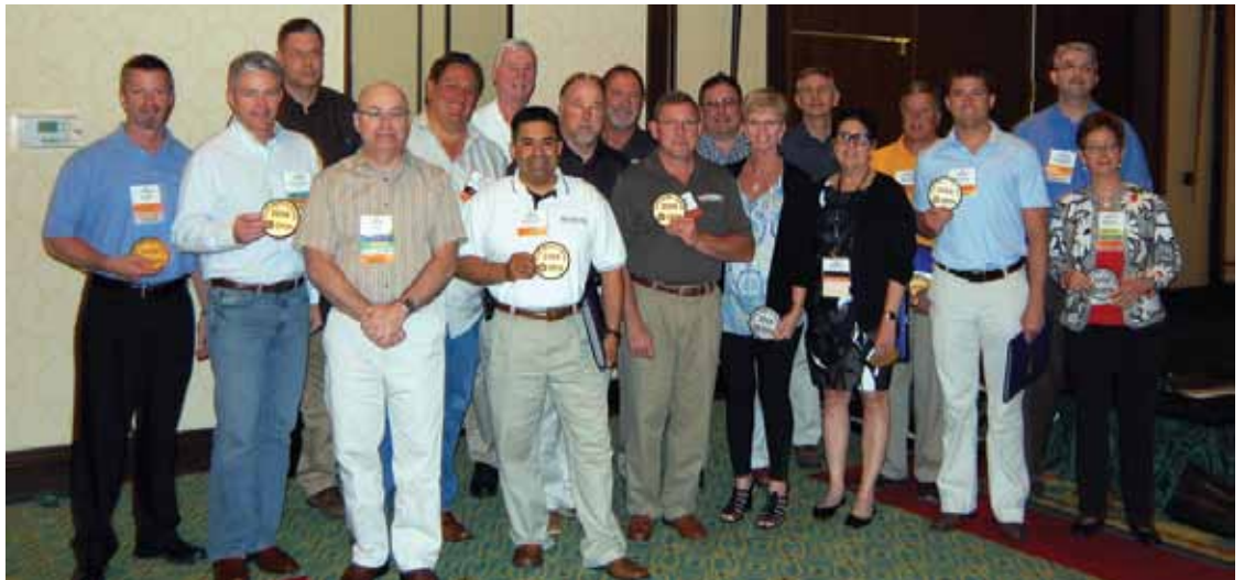
Chapter leaders from across the country accepted their 2009 Outstanding and Excellent Chapter Awards at the ICRI 2010 Spring Convention. Chapter of the Year for 2009 was the Baltimore-Washington Chapter