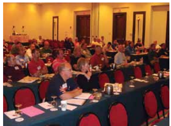
Wednesday morning and all day Thursday, attendees listened to technical presentations that were put together by ICRI's Technical Activities Committee