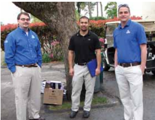
Students from the Construction Industry Management (CIM) program helping out during the golf outing