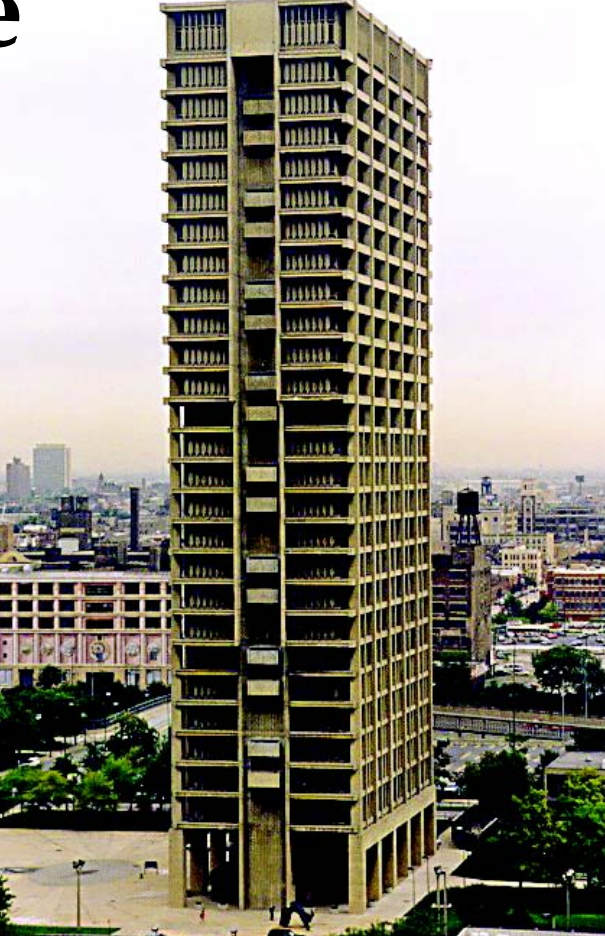
Overall view of the building

Most of the deterioration was caused by corrosion of the underlying reinforcing steel. Carbonation, salts, and air pollutants had lowered the alkalinity