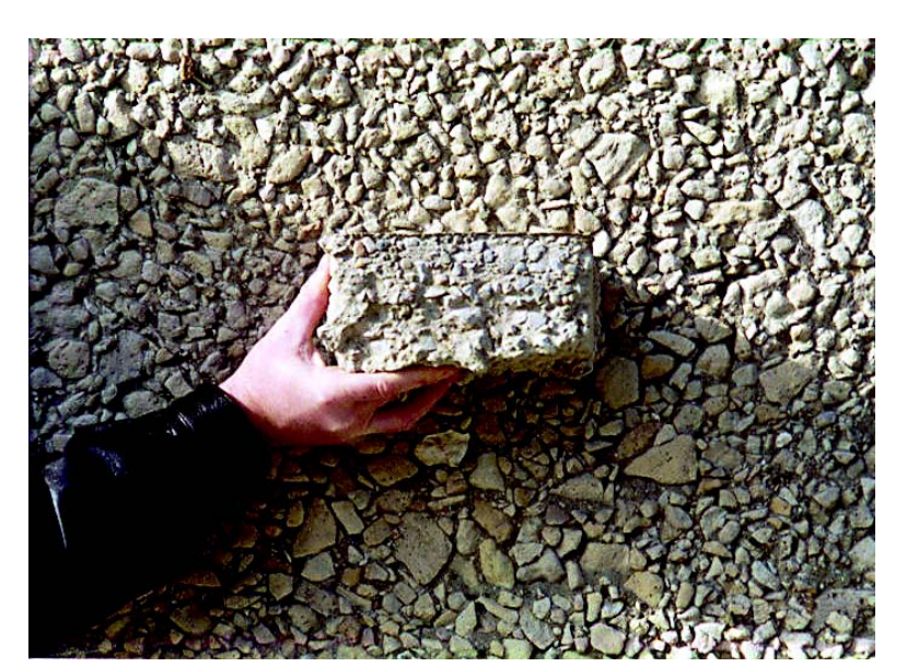
Mockup of exposed aggregate concrete

A concrete sample from one of the columns was removed for development of the new mixture. The form and pour trial mixture was used as a basis for this mixture. A 1-in.-size aggregate was added to this mixture to match the exposed aggregate on the building. Several preliminary samples with varying amounts of cement, aggregate, and surface retarders were developed. Two progress samples were brought to the site for review and were then modified in the laboratory for a greater appearance match. It was estimated that the exposed aggregate concrete could be matched for color and texture at approximately 75% success. Although the mixture could be modified further for a closer match, additional modifications could be deferred until an actual repair program was scheduled.