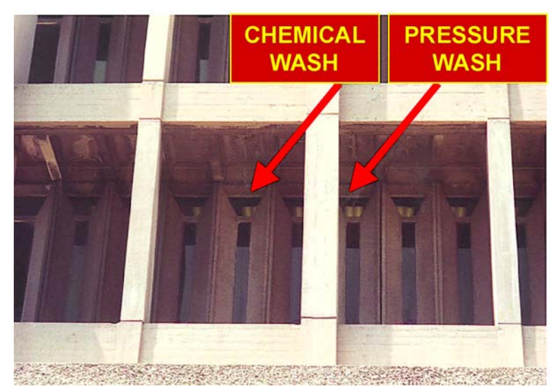
Cleaning mockup on precast window panels

The surfaces of designated areas of the precast concrete panels and the cast-in-place concrete walls