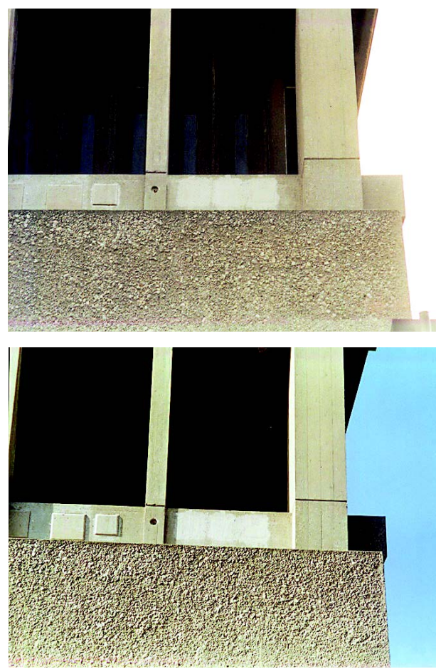
Mockup patches viewed under overcast and sunny conditions