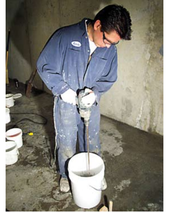
(Above and below) Crack repair using crystalline waterproofing

Though perhaps not seen as often as conventional waterproofing methods, ICW has been repeatedly and successfully tested and used in many projects around the world.