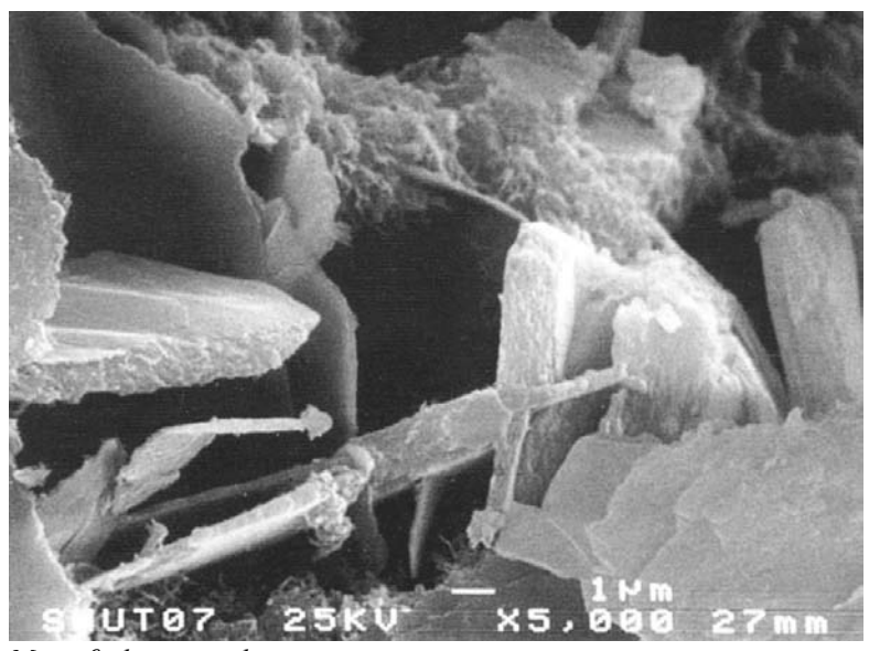
Magnified untreated concrete

While conventional waterproofing involves applying a coating or membrane to the concrete surface, integral crystalline waterproofing permanently seals concrete by plugging its natural pores and capillaries and preventing the movement of water through the concrete.