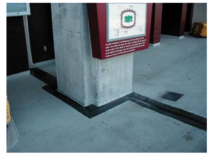
With proper planning, structural materials are aesthetically pleasing and structurally sound