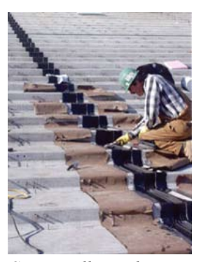
Structurally weak joints are replaced with watertight sealants to ensure safe, highquality structures