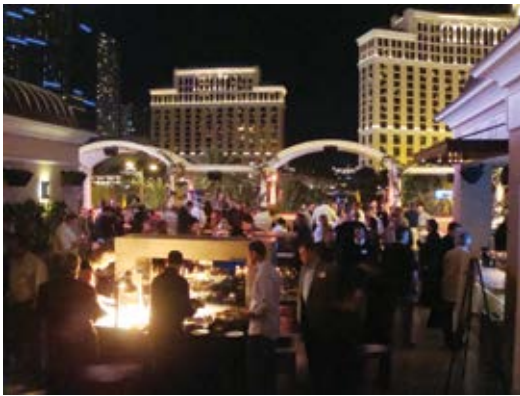
The evening's weather pulled almost all of the attendees out to the patio