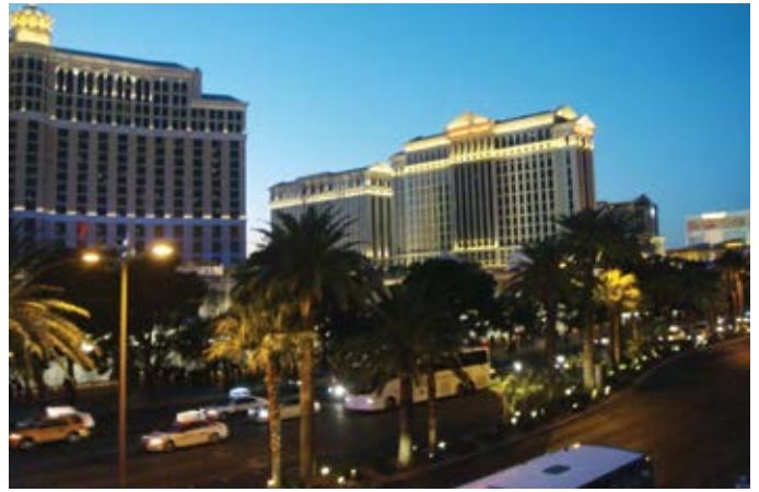
A unique view of the Las Vegas Strip