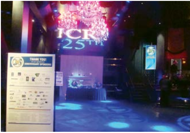
The calm before the storm inside the Chateau Nightclub