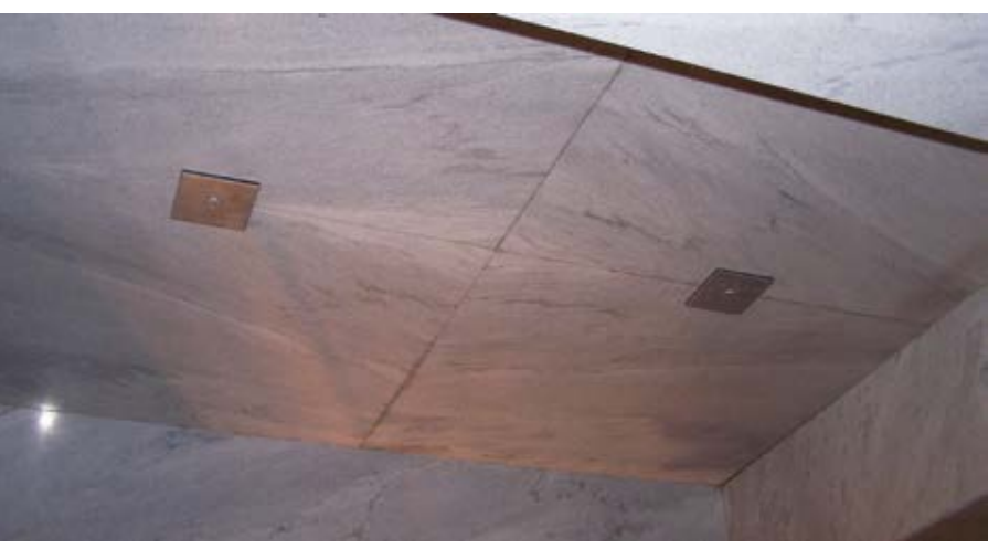
Fig. 6: Typical ceiling support assembly

panels are installed in pairs, meeting at the centerline of the hallway ceiling. A bearing pad was used to cushion the contact area of the bearing plate against the stone.