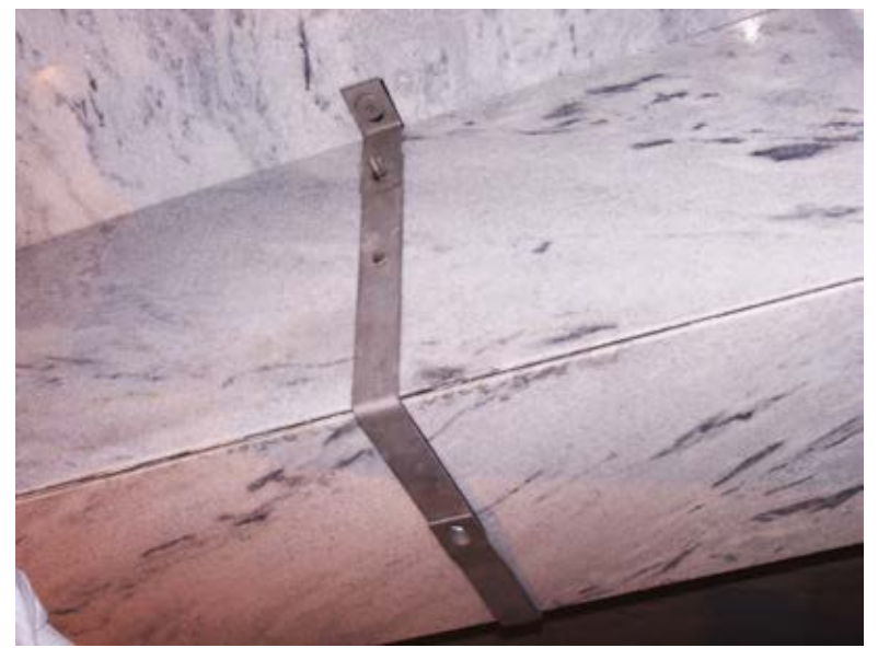
Fig. 8: Box beam encasement assembly for 18 x 18 in. (457 x 457 mm) beam

MATERIAL SUPPLIER CTP, Inc. Michigan City, IN