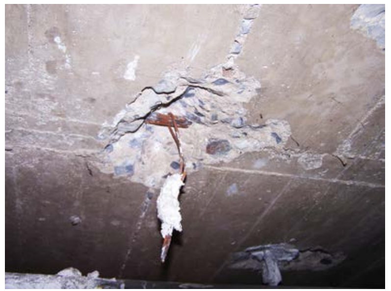
Fig. 3: Corroded tie connection to reinforcement

For the basic ceiling panel anchor, a 0.5 in. (13 mm) diameter brass expander element, torqueactivated for the concrete connection, was developed. Torque provided an important means of inspection and performance assurance. The anchor embedment depth in the concrete was tested at a minimum of 1.5 in. (38 mm) and averaged over 1200 lb (544 kg) capacity and induced a preload of 1060 lb (481 kg). These results provided safety factors greater than the industry standard of 4:1. The variable air space between the 4 in. (100 mm) thick ceiling slab and the existing panels was accommodated with a standard shaft length for the variable condition, connected by a suitably long stainless