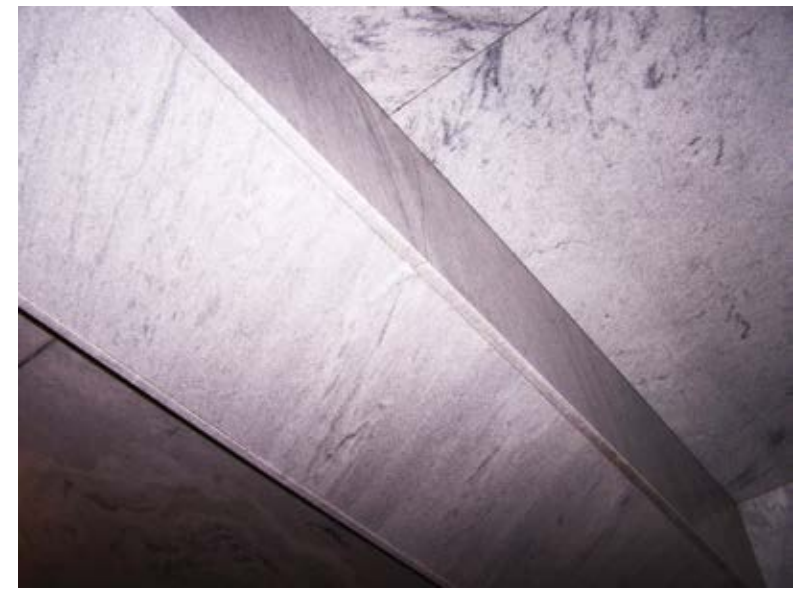
Fig. 4: Typical 18 x 18 in. (457 x 457 mm) concrete beam encasement in hallway

steel shaft assembly (Fig. 5). The head of the anchor was a 1.5 in. (38 mm) diameter stainless steel round bearing plate capable of supporting the stone panel.