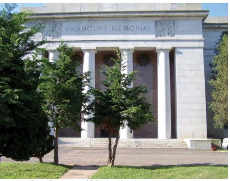
Fig. 1: Exterior view of Fairmount Mausoleum