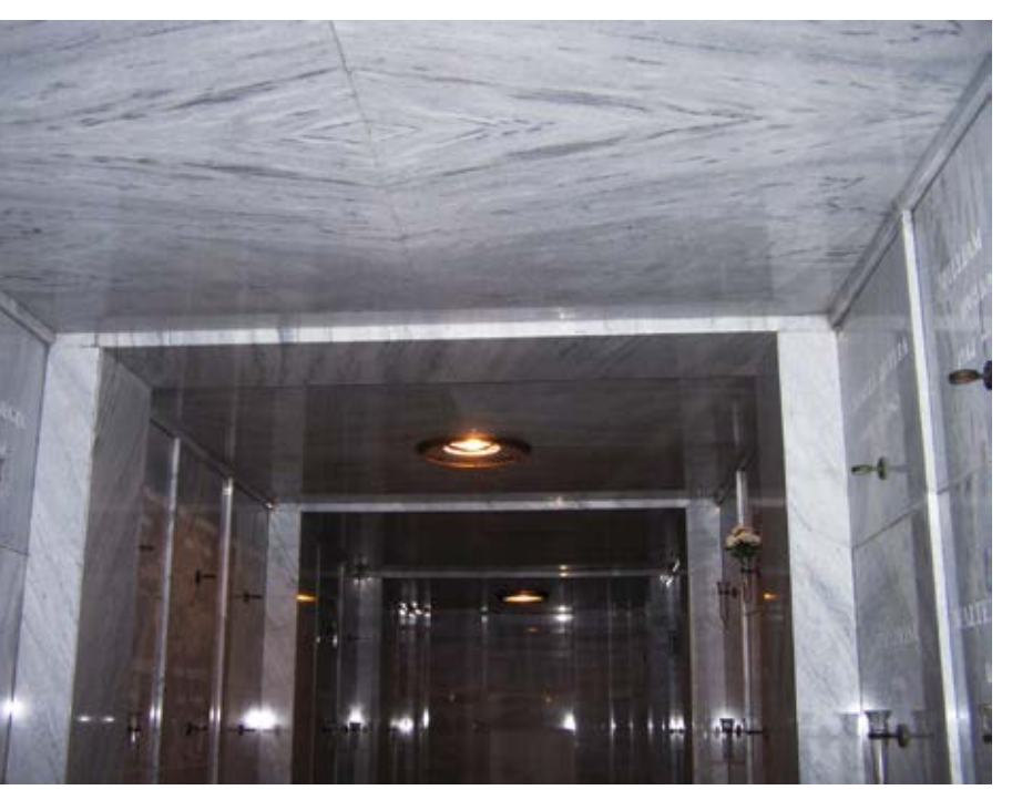
Fig. 2: Interior view with marble-clad ceiling, beams, and walls

C onstructed in the 1920s, the Fairmount Memorial Mausoleum is located on the 110 acre (0.45 km<sup>2</sup>) grounds of the Fairmount Cemetery in Newark, NJ. The 250 ft (76 m) long by 92 ft (28 m) wide "H"-configured building has a granite exterior built over a cast-in-place concrete frame and floor (Fig. 1). The building has four functional levels, including a basement. The interior walls and ceiling are veneered with 1 and 2 in. (25 and 50 mm) thick marble stone panels (Fig. 2). The mausoleum's interior environment was not conditioned for climate, and over nine decades of changing weather have challenged both the stone durability and anchorage connections.