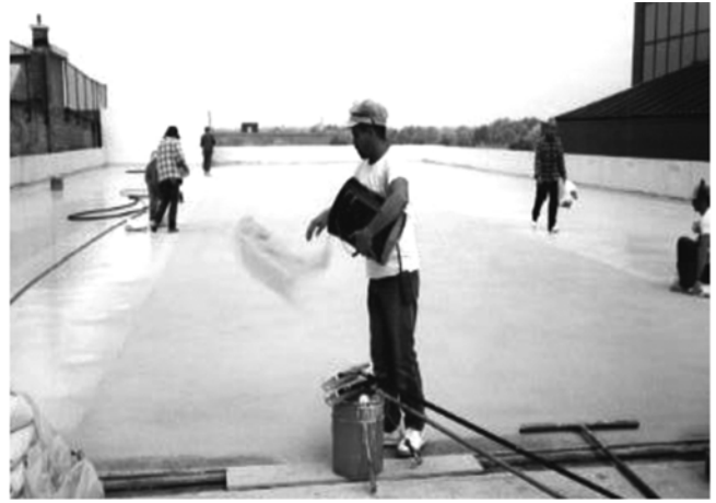
Fig. 3—Aggregate broadcast onto the surface before the resin cures can increase traction.

shorter set time (shorter pot life) materials should be used when it is necessary to open the slab to traffic quickly.