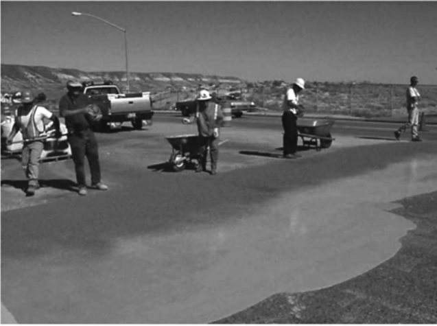
Fig. 4—Aggregate should be broadcast over the surface before the resin becomes tacky but at least 20 minutes after applying the final coat.

4. Pre-fill all cracks 1/8 in. (3 mm) wide or wider with clean, dry aggregate;