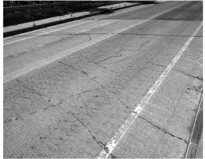
Fig. 1—Methacrylate flood coats are well-suited to concrete slabs that have a large number of random cracks but no evidence of steel corrosion or AAR.

This repair is well suited to bridge decks, parking garages, industrial floors, or other concrete slabs that have a large number of random cracks but no evidence of steel corrosion or AAR, such as the roadway shown in Fig. 1. The effect of the methacrylate on skid resistance should, however, be considered for bridge decks exposed to heavy traffic and high speeds. The methacrylate flood coat will seal the slab and fill open cracks, with the intent of keeping water, salts, and chemicals out of the concrete. Methacrylates are not