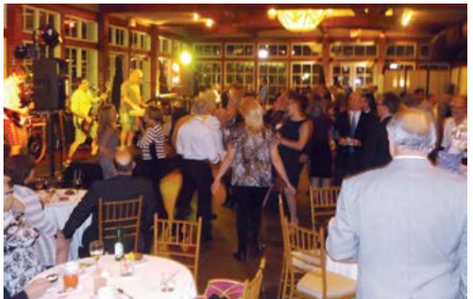
The dance floor was packed...