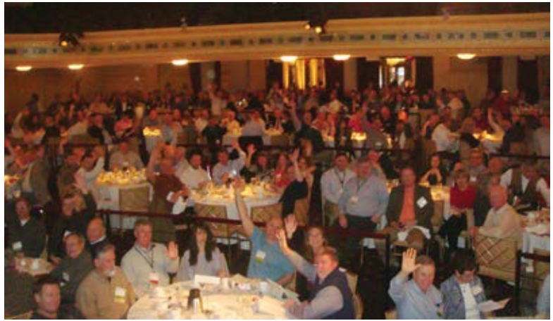
The Millennium Broadway Hotel's historic Hudson Theater was filled to capacity for the Recognition Luncheon and General Session on Thursday afternoon