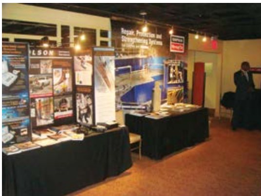
Quiet time in the exhibit area before attendees begin to arrive