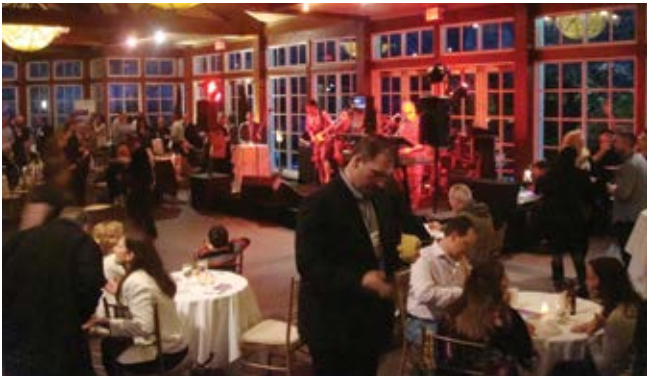
The Metro New York Chapter made sure the Central Park Boathouse Celebration rocked with an appearance by a local band called "The Nerds"

Thursday is the busiest day on the convention schedule, but Thursday night is the time to celebrate. The Metro New York Chapter reserved a spot at the Central Park Boathouse and blew the roof off the joint with an amazing array of food and live music that had attendees on the dance floor. Buses brought attendees from Times Square to the Loeb Boathouse located right in the middle of Central Park. Situated on a lake, the Boathouse is known for its iconic views of the surrounding skyscrapers as well as the tranquility of the setting. Guests dined on a variety of passed hors d'oeuvres as well as a well-stocked buffet line. The open bar and the views from the deck were among the favorites of the group. To that mix, the chapter added the high-energy sounds of "The Nerds," who took the stage and shortly had the room dancing to some awesome rock and roll favorites. It