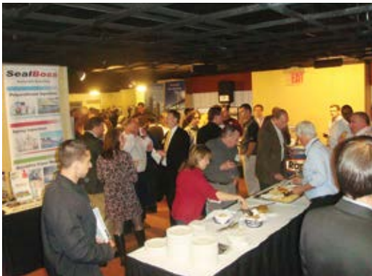
Attendees filled the exhibit floor for the traditional Welcome Reception on Wednesday evening