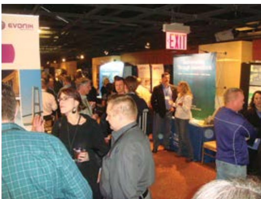
The Welcome Reception is the first chance for attendees to meet up and get a look at what the exhibitors have to offer