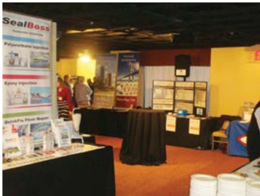
The ICRI 2015 Spring Convention exhibit floor was another area where ICRI broke a record at this convention—53 exhibitors joined ICRI for this event

The spring schedule allows attendees to attend the technical presentations on Wednesday morning with no other afternoon meetings scheduled to compete for their attention. The local Metro New York Chapter recognized why people come to their city and organized a bus tour of Manhattan for those interested on Wednesday afternoon. The tour hit all the hot spots on the island and the guides were a hit with the attendees. Despite a few moments of rain