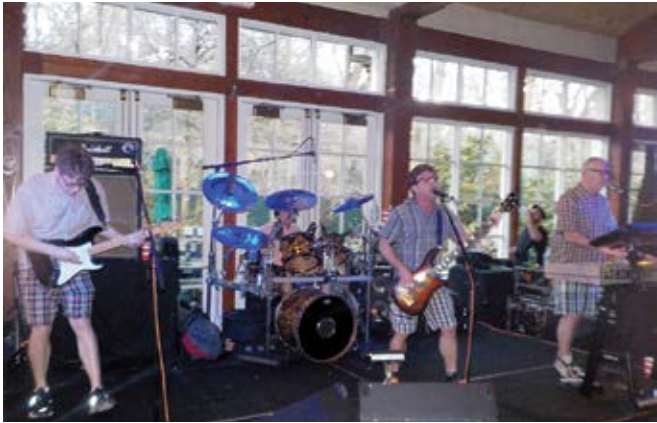
The Nerds rock out

We hope to see everyone at the ICRI 2015 Fall Convention in Ft. Worth, TX. ICRI will be at the Hilton Ft. Worth from October 14-16. The theme for this fall event is “Modern Trends in the Repair Industry” and the committee is currently looking for presenters, so be sure to submit a presentation abstract before July 6, 2015. In addition, be sure you sign up to attend the 2015 Project Awards dinner and celebration. We are getting things done at ICRI and would like to extend an invitation for you to get involved. Make the most of your membership and come to a convention.