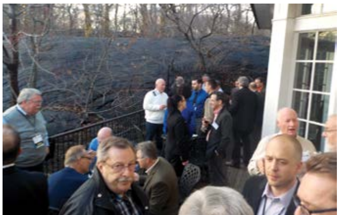
...as was the deck, for those looking to chat, not dance