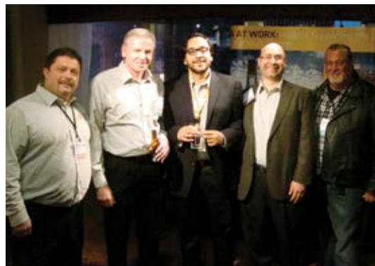
Members from Sika Corporation were eager to welcome ICRI and convention attendees to New York, NY, their hometown