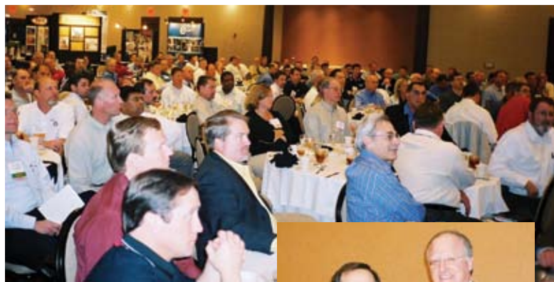
Attendees at the Annual Recognition Luncheon on Thursday

Friday was the last day of the convention and it too was packed with activities. Attendees filed through the exhibits for the last time before a few more committee meetings and the final technical sessions rounded out the morning. On Friday afternoon,