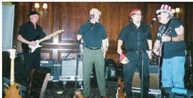
... and the show must go on—costume changes and all. No price is too high to pay for quality entertainment!