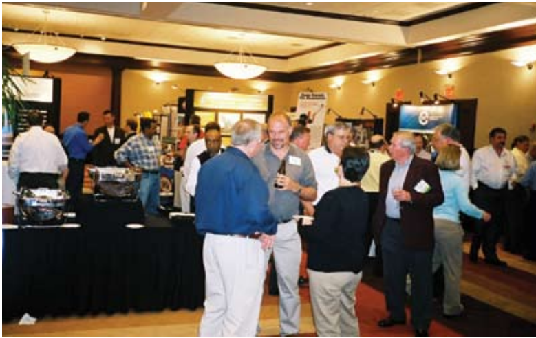
The Welcome Reception at the Spring Convention gives attendees the opportunity to network with each other