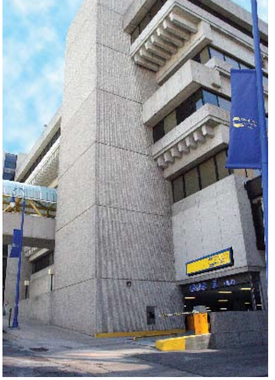
Fig. 6: Parking levels below office and classroom space

The original contract for construction was approximately $1.1 million. Construction estimates for restoration projects are often difficult to establish and cost increases can result after a more accurate assessment of existing conditions is performed during construction operations. Additional costs to this project associated with unanticipated conditions,