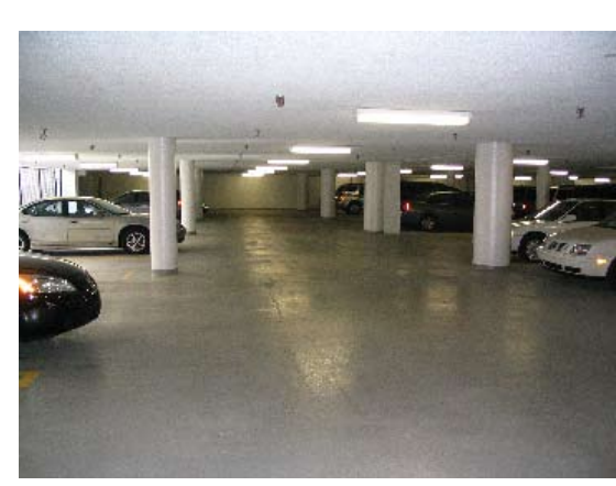
Fig. 5: Finished slab with deck coating

just below the slab to be removed and was attached to the wall using epoxy anchors.