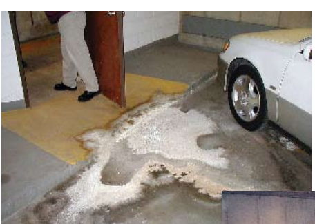
Fig. 2: Ponding and ice near exit

One of the factors that contributed to the accumulation of chloride ions and moisture in the original slab was poor drainage (Fig. 2). The original slab at Level G2 provided drainage in one direction only. The new slab was designed with an improved