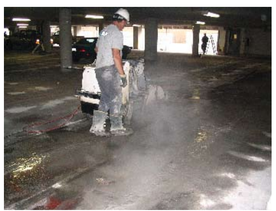
Fig. 1: Sawcutting for slab removal

Other components of the selected repair option involved patching of concrete delaminations at the