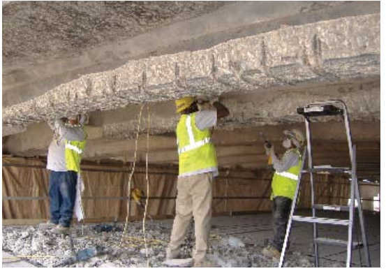
Fig. 3: Removal of delaminated concrete along the beams and deck