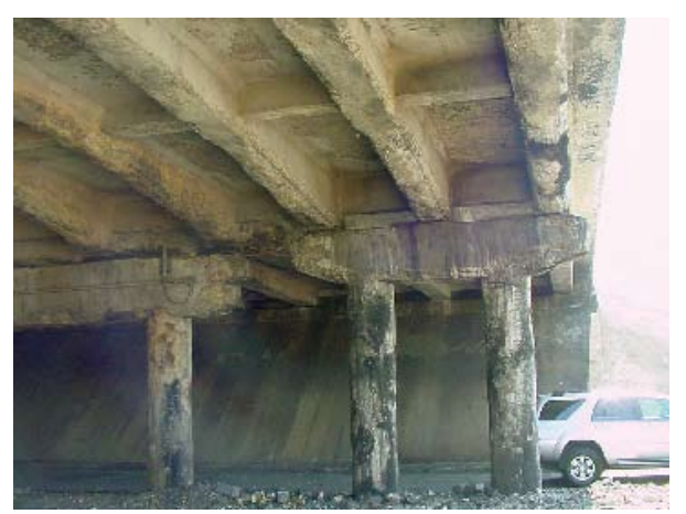
Fig. 1: View looking east of the charred remains of Bent 4 and adjacent areas

Later that afternoon, state transportation officials placed concrete barriers on eastbound State Highway 183 to block off the two right lanes and prepared to open one eastbound lane and both service roads