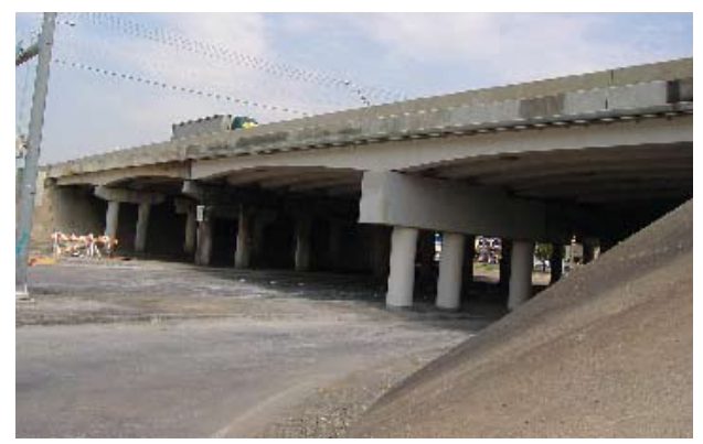
Fig. 6: Completed substructure looking northwest. Bent 4 with the large "straddle" bent is in the foreground

The repair contractor worked crews of six to eight men for 10-hour shifts each, two shifts a day, 7 days