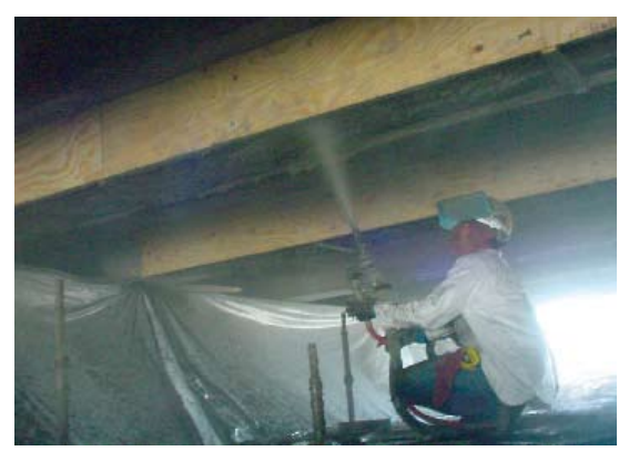
Fig. 5: Wet-spray shotcrete applied to underside of beam

due June 16. The bids were reviewed and the project was awarded to a general contractor, and contracts were signed that same day. June 18 was the official start date of the project.