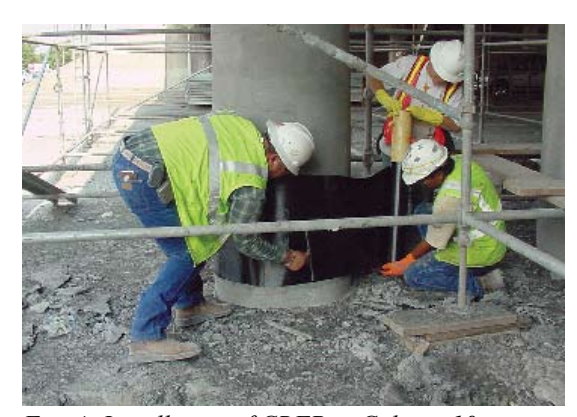
Fig. 4: Installation of CRFP to Column 10

A June 13 prebid meeting was held on site with plans delivered to the bidders at this time. Bids were