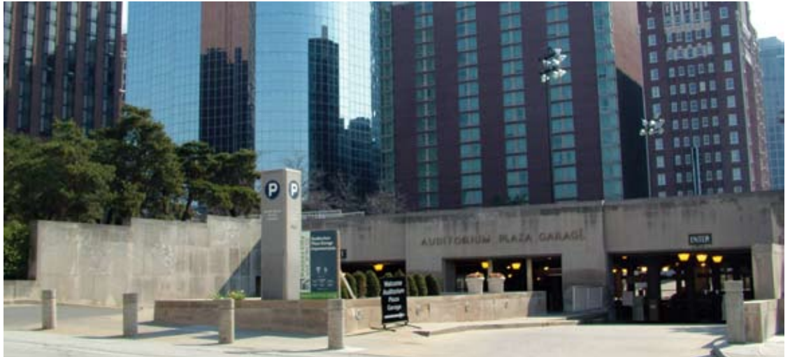
Central Street entrance to the Auditorium Plaza Garage

Submitted by Structural Engineering Associates