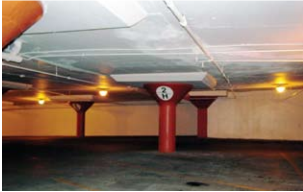
Garage, Level 2, following concrete repairs and painting