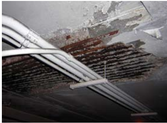
Existing soffit corrosion (note the electrical conflicts/challenges)

During the initial stages of design, it was decided to excavate and expose the north and south tunnels under 12th and 13th Streets, respectively, so as to