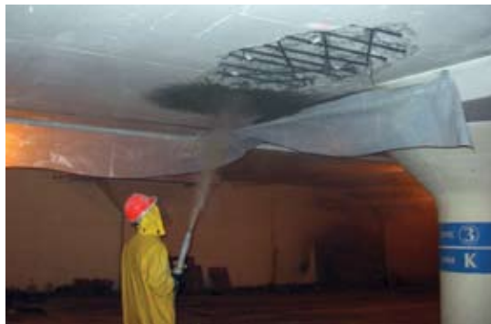
Shotcreting a soffit

repair and waterproof the leaking tunnels from the positive side. After further analysis and discussion with the owner, however, the engineer was able to provide a value engineering solution consisting of the application of a crystalline waterproofing system from the negative, inside of the tunnels. This repair approach saved the city approximately $275,000 in construction costs and traffic disruption.