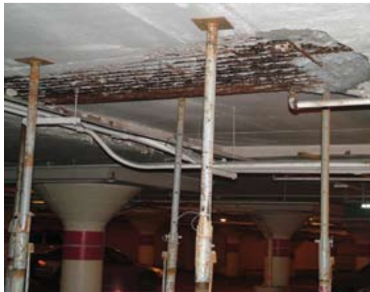
Delaminated soffit repairs