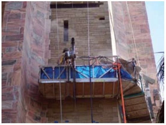
Coguina brick replacement