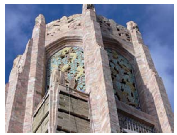
Close-up of beautiful coquina brick on Bok Tower

he Historic Bok Sanctuary in Lake Wales, FL, is 40 miles south of Orlando. The 250-acre sanctuary consists of botanical gardens with hiking trails, an estate, and Bok Tower. Construction of the gardens started in 1921 as a vision of a wealthy editor from Philadelphia named Edward Bok and was completed in 1926. Bok Tower was constructed between 1927 and 1929 as the focal point of the sanctuary. The tower houses a 60-bell carillon (set of tuned bells in a tower played by a baton keyboard) and produces a glorious sound, similar to that experienced by Bok as a child in his native country of Holland.