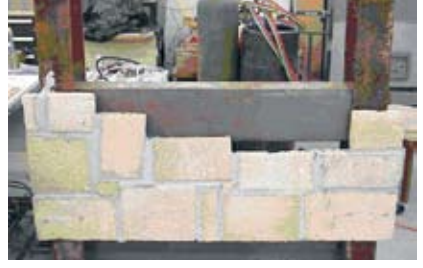
Mockup tower section

Because of the significant protection requirements given the ornate characteristics of the tower and its National Landmark status, a team of specialists experienced in historic preservation and cathodic protection was used to ensure project success. Bok Tower has been repaired to the highest standards to ensure long-lasting, high-performing durability consistent with its prominent listing as a National Historic Landmark.