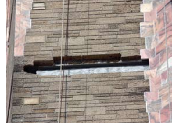
Coquina brick and underlying masonry had separated from tower

Cracks developed in the coquina brick, largely in the areas of the spandrel beams. Furthermore, highly distressed areas showed signs of bowing or