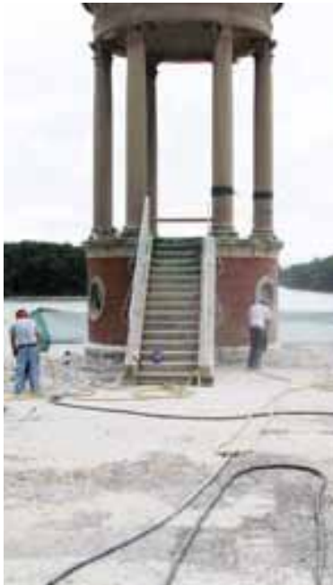
Belvedere during restoration