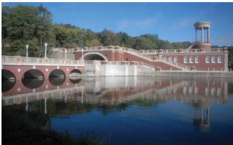
Restored boathouse at University of St. Mary of the Lake

As part of the restoration, severely deteriorated asphalt topping was removed from the two piers leading out over the water. The asphalt topping was removed along with the gravel fill, which was stored for reuse, and the concrete pier structure was restored with the installation of a new buried waterproofing system. The reused gravel fill was added back and supplemented with new appropriated graded fill and a new concrete-topping slab was