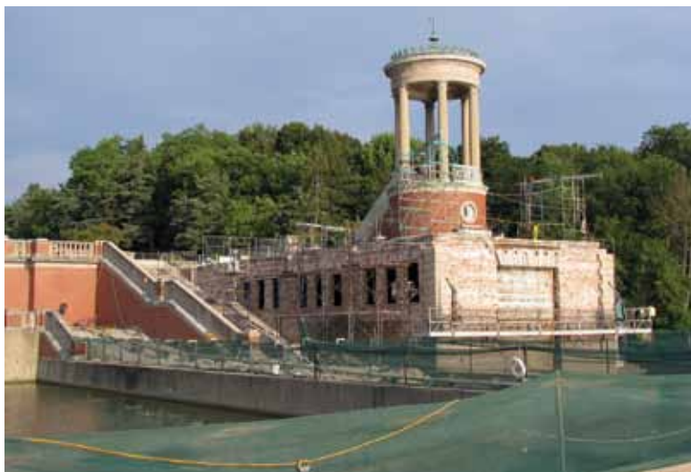
Boathouse during restoration