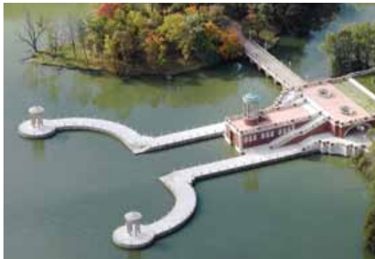
Restoration project at University of St. Mary of the Lake from above

Submitted by Zera Construction Company, Inc.