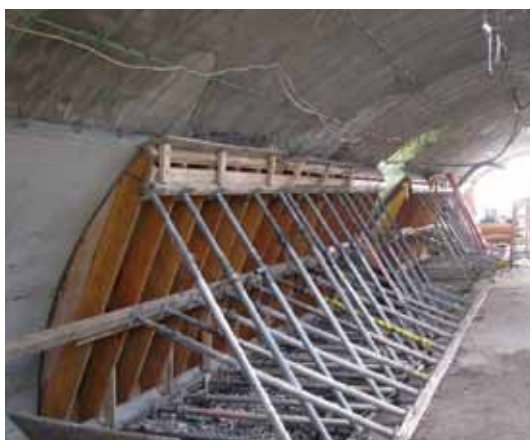
Viaduct interior during restoration

installed throughout the piers and adjacent approach areas. In addition, a pedestrian traffic-bearing waterproofing membrane system was applied to the concrete stairs and the concrete structure below the pavilions at the end of each pier. To complete the piers, historically accurate pier bollards and chains were recreated from the original design drawings.