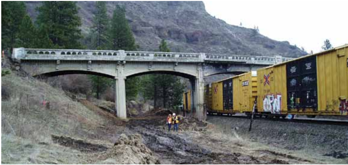
80 years of deterioration

bridges to their original condition while preserving them from further deterioration. The Upper Perry Arch Bridge is one of the bridges to benefit from this program.