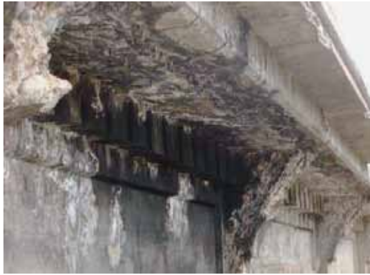
Extensive deterioration to corbels and dentils