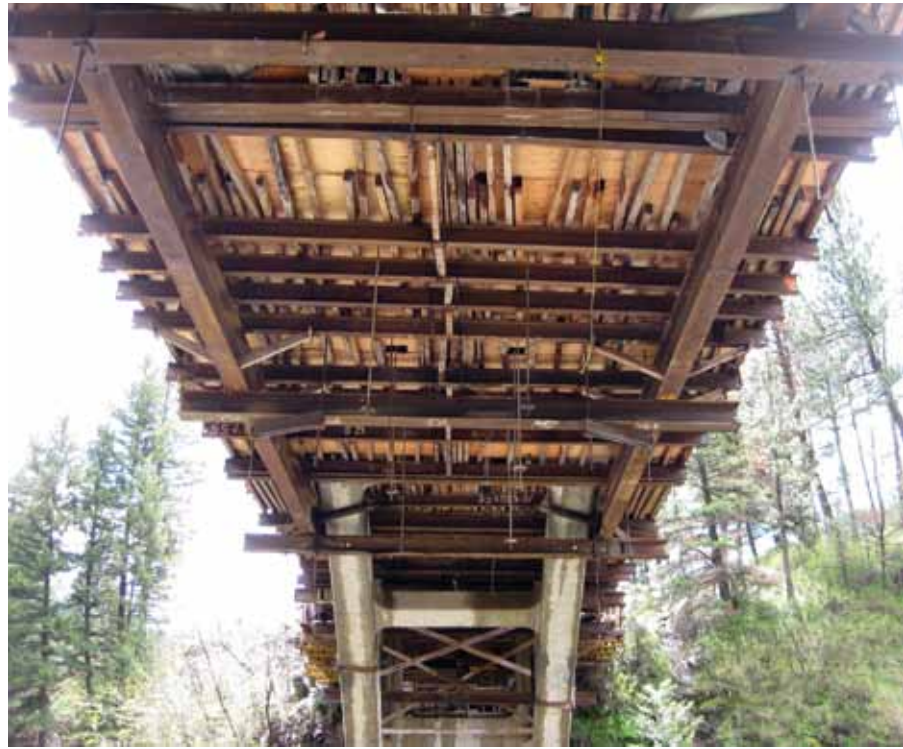
Deck shoring from below

After the formwork was removed, the entire structure was patched, ground, painted, and sealed. The entire structure was Class 1 and 2 surface finished. Class 1 involved grinding the surface to remove laitance and surface film. Then, a silane sealer was applied. The Class 2 surface finish had an additional step between the laitance removal and