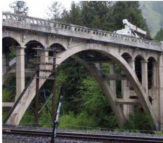
Upper Perry Arch Bridge prior to restoration

Deteriorated concrete had to be removed using handheld jackhammers and replaced with repair grout before other work could begin.