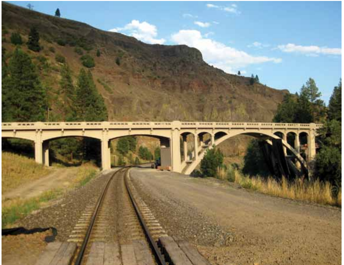
Upper Perry Arch Bridge after restoration

Submitted by The Euclid Chemical Company