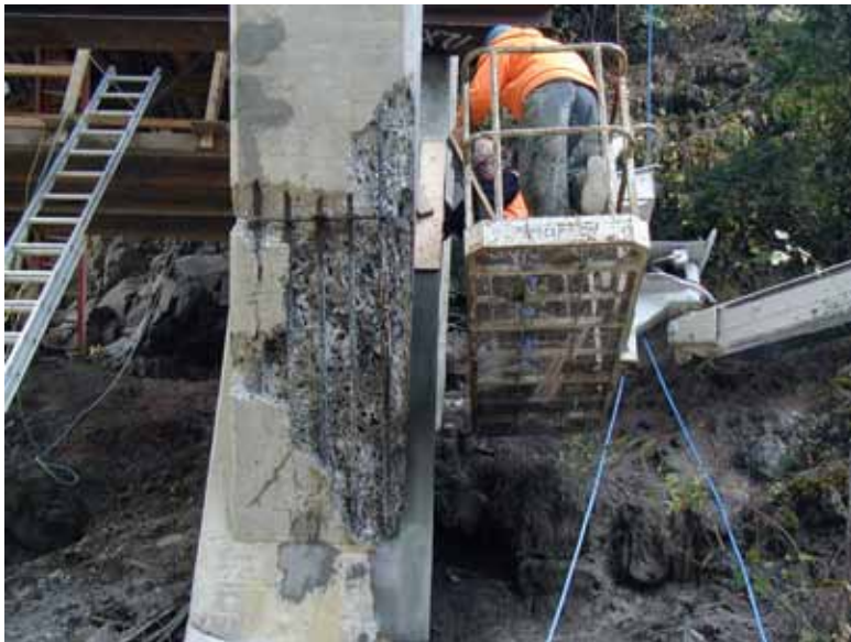
Arch deterioration accessible by man-lift