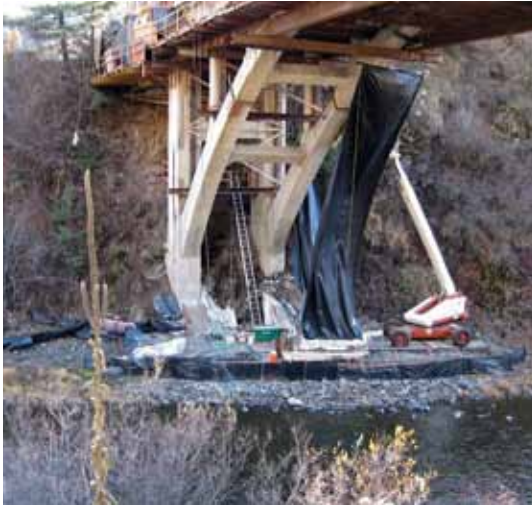
Work performed from man-lifts and netting used to contain concrete debris during surface preparation