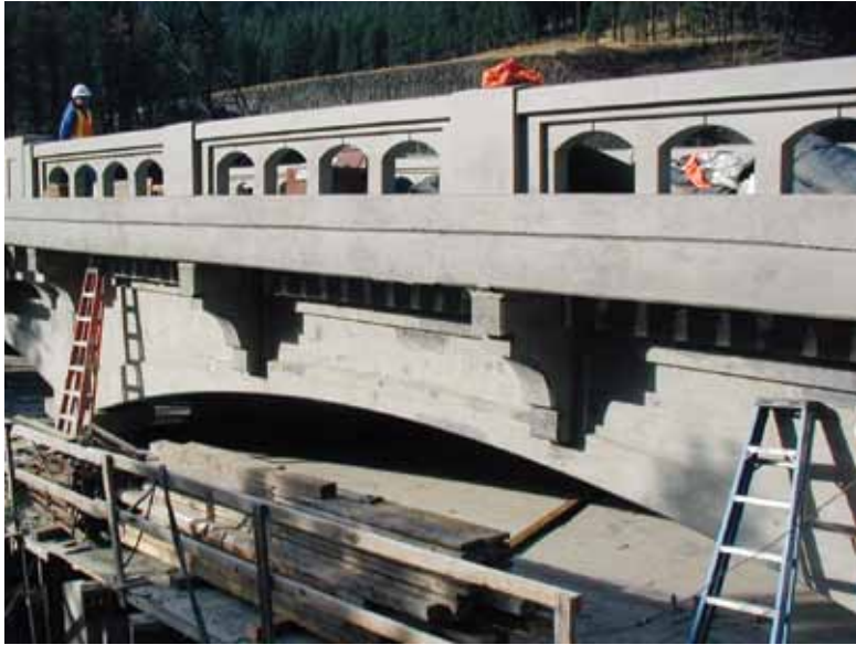
Repaired corbels and concrete railings

coating application. The surface was floated with a rubber sponge (or float) using a paste of sand, cement, and a bonding agent mortar to fill all surface voids to bring the surface to a uniform texture. For the Upper Perry Arch Bridge, 20,000 ft 2 (1858 m 2 ) of the structure was Class 2 finished, and 10,000 ft 2 (929 m 2 ) of the structure was Class 1 finished. These areas were also coated and sealed with a waterproof sealer.