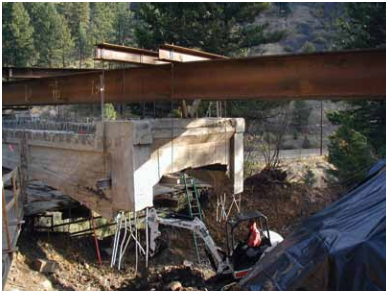
Suspended arch while footing and columns replaced in one section

This work included rehabilitating four approach spans and complete replacement of the span supported by the main arches. All bridge rails, cross-beams, decks, spandrel posts, sidewalk brackets, and corbels were demolished and replaced. The arches and bents were salvaged; the cracks were injected with epoxy; and the unsound, deteriorated concrete was removed and repoured in place.