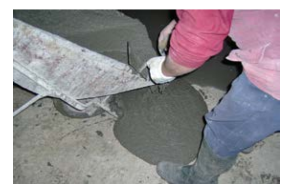
Workers placing overlay mixture

Composite materials are typically considered as materials with limited ductility. Their fracture behavior is often described via models that simulate a cohesive crack. After exceeding the tensile strength when a cementitious material is loaded in pure tension, even under controlled deformation, a