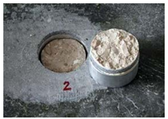
Core of floor showing bonding of overlay to existing concrete

The deformation e^{fes} is calculated with a bilinear function. When the stress in a point of the model exceeds the tensile strength of the material, it generates the creation of a fictitious crack. The real crack is developed only after consuming the energy of rupture of the material.