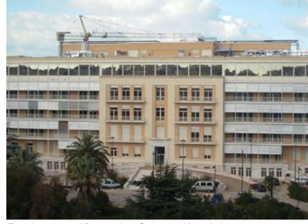
Exterior view of Domenico Cotugno Hospital