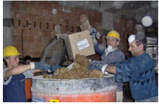
Workers adding fibers to overlay concrete mixture

account both the mechanical stresses and those imposed by the shrinkage of the cover slab. For the study, a numerical analysis (finite element method) was used to calculate strains, stresses, formation of cracks, and delamination of the cover slab based on nonlinear fracture mechanics.