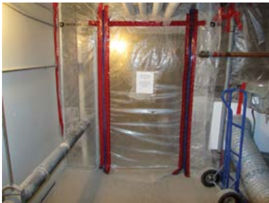
Infection containment system in work area

through slab drop panels. Cracking was found to be full-depth at portions of the waffle slab and the crack widths were found to vary with seasonal temperature exposure at the roof level.