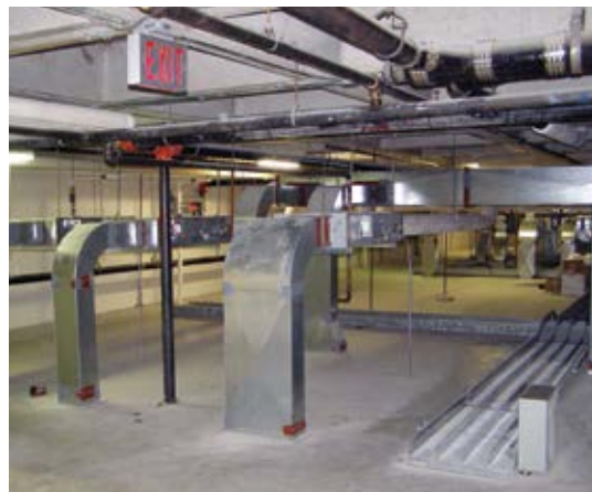
Mechanical equipment located in work area