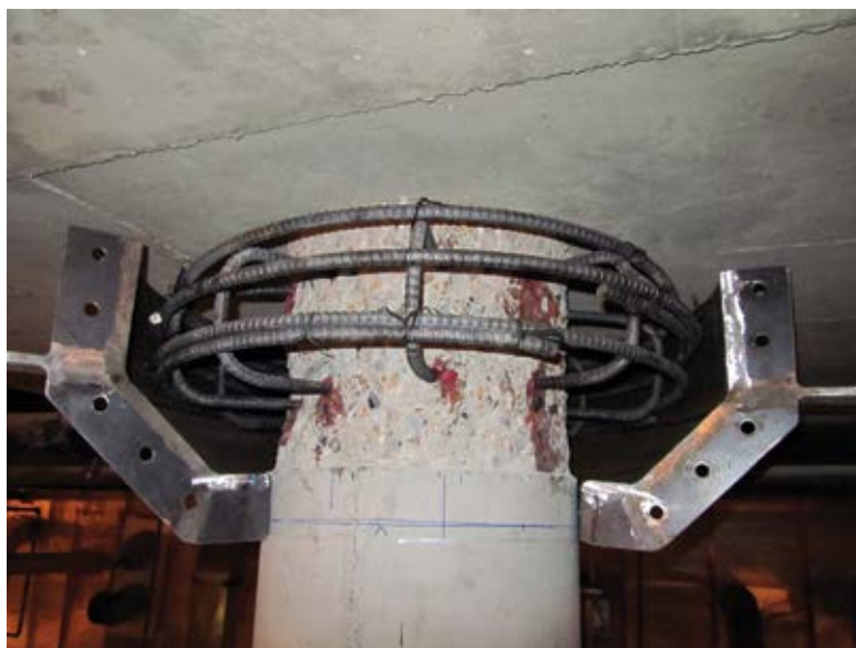
Formwork and reinforcement for column strengthening