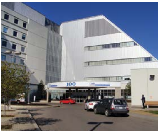
Exterior view of Saskatoon City Hospital

Based on a review of the post-tensioning stressing plan, the post-tensioned waffle-slab system was stressed in phases during initial construction. From a subsequent review of stressing calculations, it was determined that portions of the waffle-slab system could have cracked during initial stressing due to high post-tensioning forces. During the investigation of the building, cracking consistent with this post-tensioning stressing