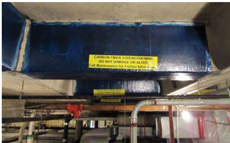
Carbon-fiber reinforcing of beam section