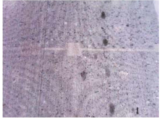
Deck surface after micro-milling