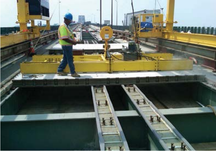
Setting panels with gantry crane

ation performed prior to opening the completed section of bridge to traffic. Phase 3 is in progress at this writing and is scheduled for completion in June 2013.