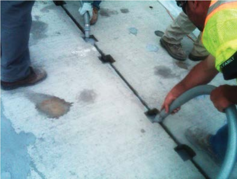
Grouting of transverse joint