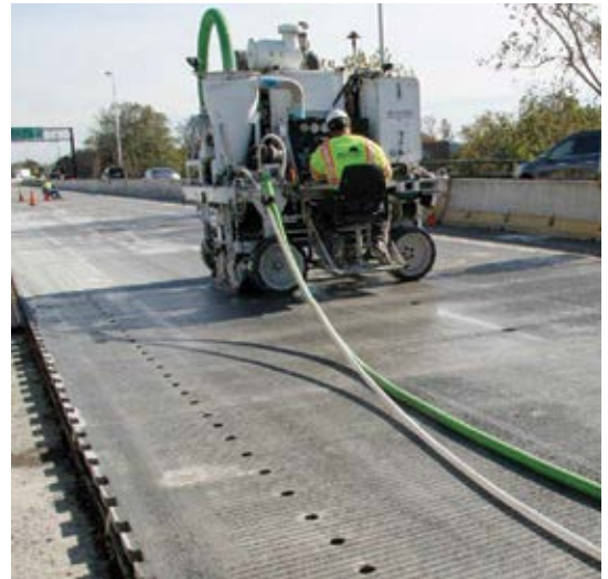
Saw-cutting and grooving