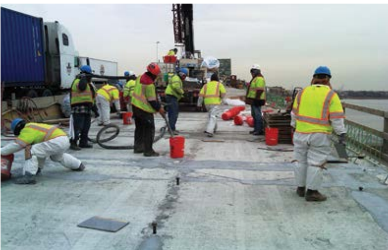
Grout operation in progress