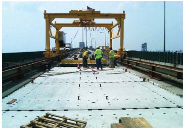
Setting panels with gantry crane

The precast deck panels were primed at the manufacturing plant and shipped to the site. All panels had to be grouted the same day they were placed for the process to be repeated the next day. Like a train, if one operation stopped, the entire train would come to a halt. A flatbed trailer was used to transport the grout, equipment, and all other materials. With this flatbed, it was easy to remove all materials from the site nightly.