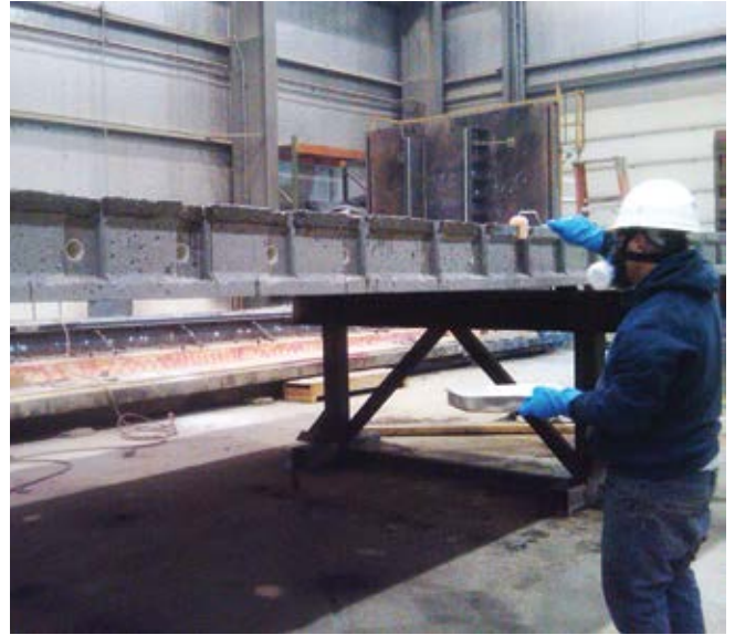
Applying primer to precast panel in plant