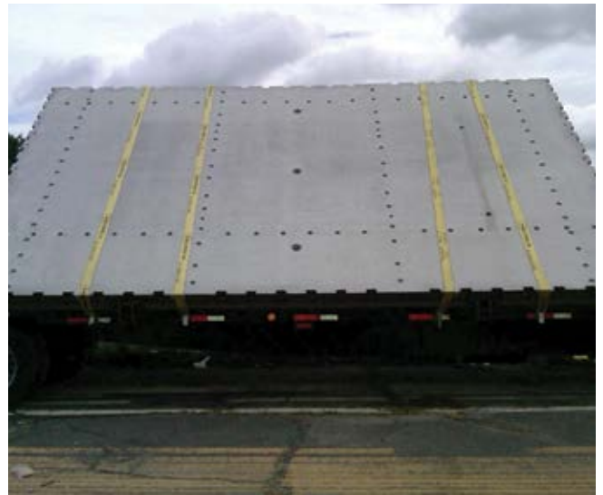
40,000 lb (18,144 kg) panel ready to ship 200 miles (322 km) from the plant to the job site

A second survey of the existing steel superstructure was then done to allow the contractor to account for structural steel rebound and calculate the new haunch heights. These calculations determined the size of the shear studs to be set at any given point along the bridge and also to determine the thickness of MMA grout that would be pumped under the new deck panels. The new shear studs would also have to be precisely spaced to match the haunch pockets cast into the bottom of each new deck panel. This was particularly challenging, as there were 116 different types of panels detailed for the project.