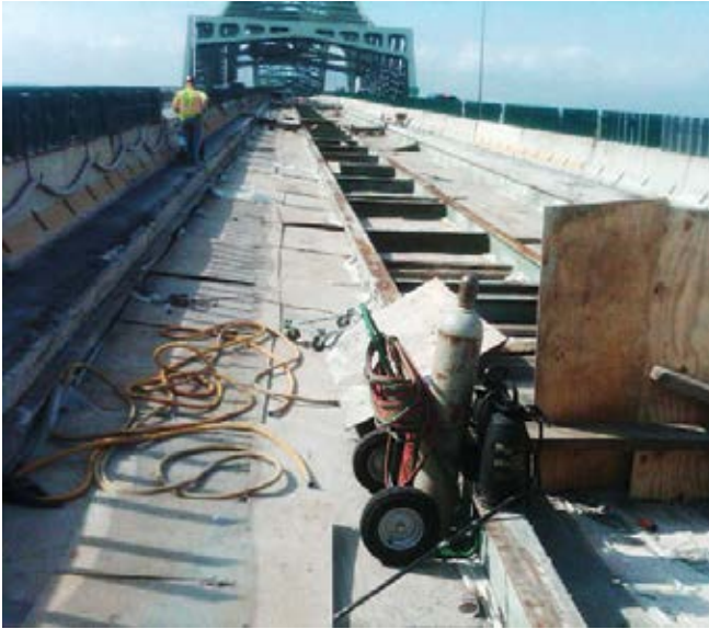
After deck shows catch system in place