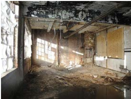
Inside of factory before restoration