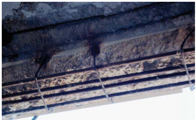
Close-up of spandrel beam repair