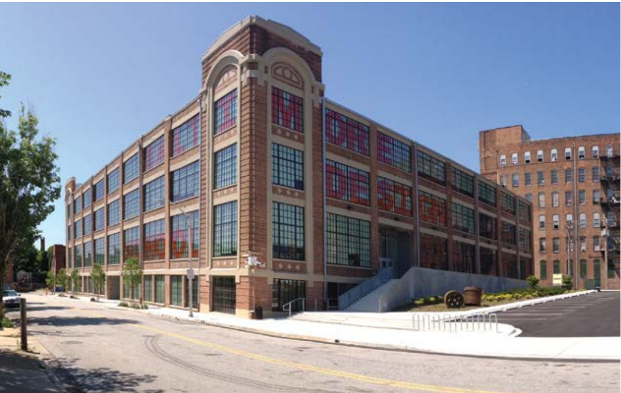
The abandoned factory before renovations and the completed school after renovations