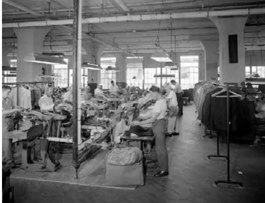
Workers in the original factory

caps before housing a clothing manufacturer. The Crown Cork and Seal Company machine shop was designed in 1914 by Baltimore Architect Otto G. Simonson and built by the West Construction Company. Constructed of reinforced concrete, the