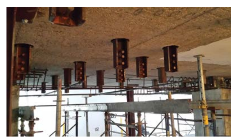
Steel lug keys and reinforcing bars in the drop panels

panels were hung from the lug keys, and the posttensioning cables were installed within the cage. Post shores were installed underneath the drop panel formwork and across 100% of the tower area on all three levels of the garage. This shoring would support the new construction of the drop panels and overlay. In total, 2800 post shores and 200 shoring towers were used for the drop panel and overlay construction.