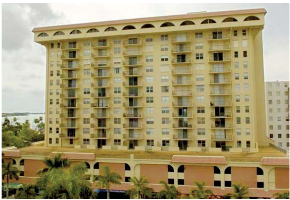
The Dolphin Tower building