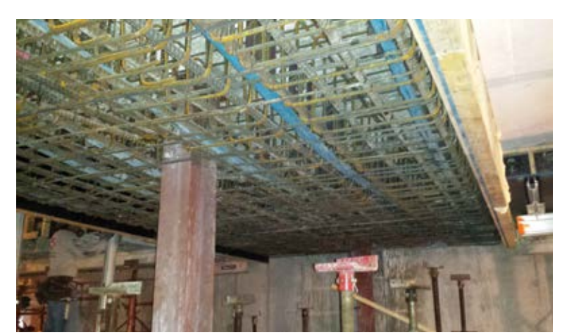
Post-tensioned drop panels with formwork