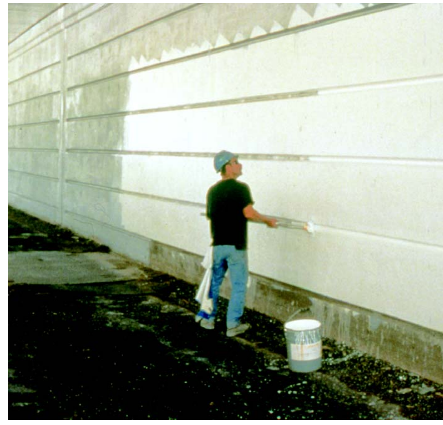
Urethane coatings can be applied easily by brush, roller, or sprayer at a thickness of 3 to 4 mils DFT

Using a penetrating urethane primer, the entire surface to be coated should be primed and allowed