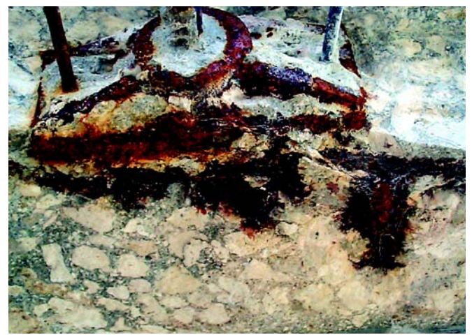
Anchor with spalled concrete exposing corroded bursting bars

strands that are anchored at each end but remain permanently free to move within the slab, as they are unbonded and encased within a plastic sheathing. This assembly of strand and anchors is referred to as a tendon and these tendons are the primary means of reinforcing the slab. Each 1/2 in. (1.3 cm) tendon is usually stressed to a load equal to 33,000 lb (15,000 kg) of force. In most residential buildings, the tendons are placed in two directions. In one direction, the tendons are evenly spaced approximately every 16 to 24 in. (41 to 61 cm) on center and are referred to as the uniform tendons. Running perpendicular to the uniform tendons are the band tendons. These tendons are usually spaced approximately 6 to 12 in. (15 to 30 cm) apart in very tight