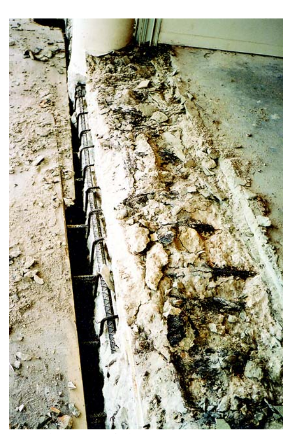
View of same area before repair