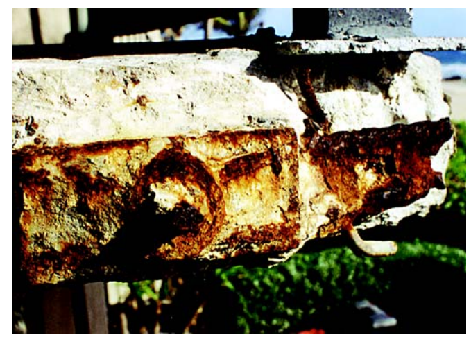
Anchor with spalled concrete exposing corroded bursting bars

Structural engineers and property managers may be well informed about corrosion-related concrete repair issues but sometimes do not recognize the significance of these issues in the context of a posttensioned structure. This can lead to a dilemma when the need arises to repair the slab edges due to corrosion of the steel bursting bars, particularly if the exposed portions of the post-tension anchors and strand