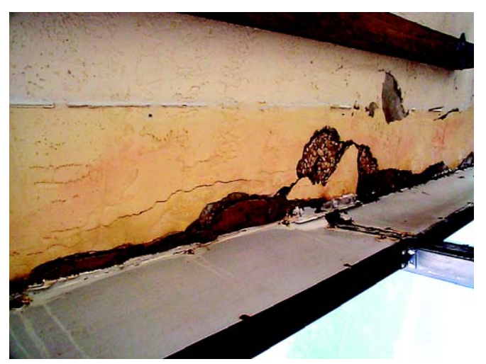
Balcony slab edge showing previous repairs that have failed and are spalling