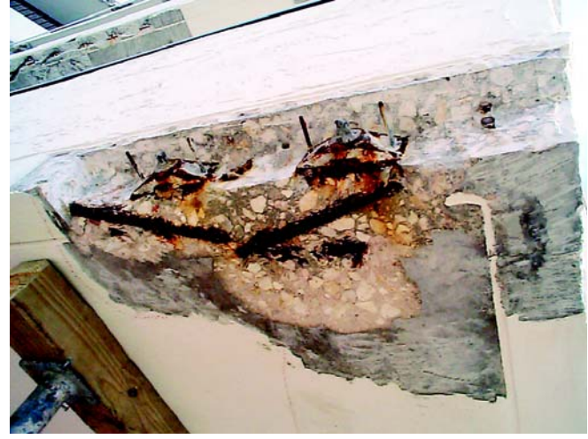
Anchors with spalled concrete exposing corroded bursting bars