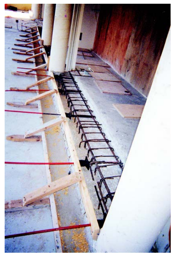
Correct repair of post-tensioned slab edge/beam

It is further stated in Section 3.2 of another ACI Committee Report, 222R-96, "Corrosion of