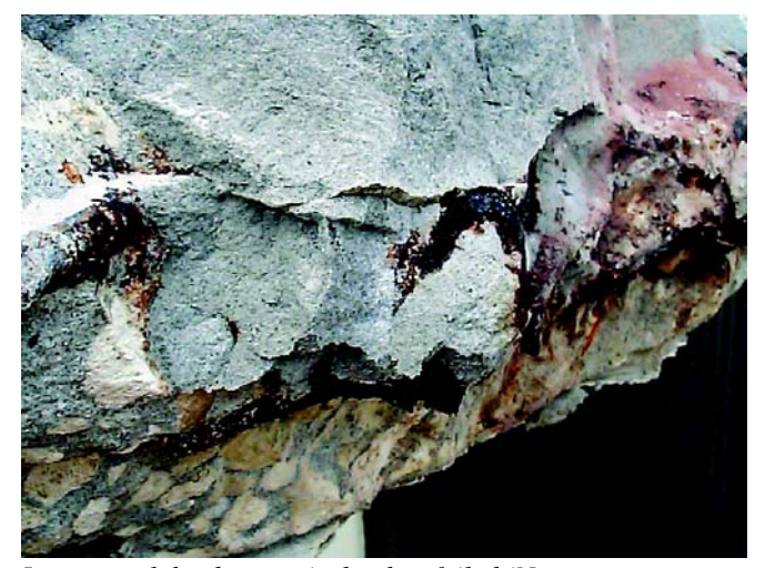
Improper slab edge repair that has failed (Note new mortar on top, old substrate below, and bursting bars sandwiched between)