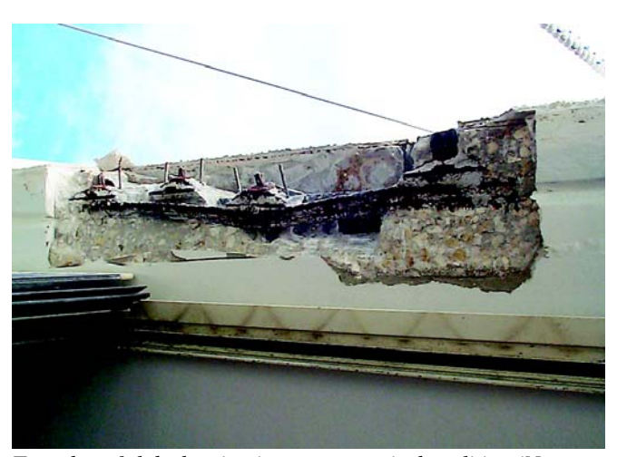
Top edge of slab showing improper repair demolition (Note corroded reinforcing steel and cracks in concrete behind anchor)