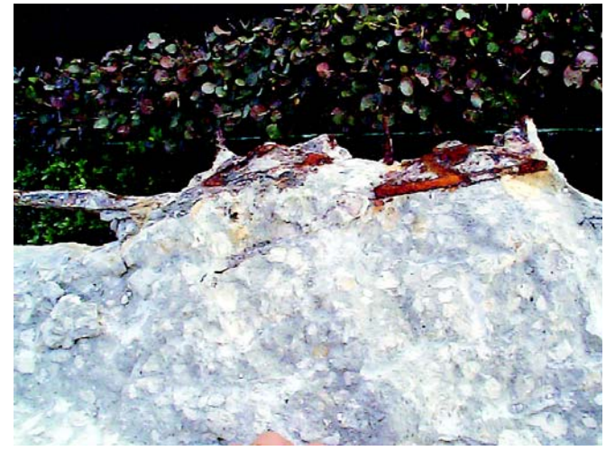
Anchor that is still under tension and has burst out of concrete during repair demolition