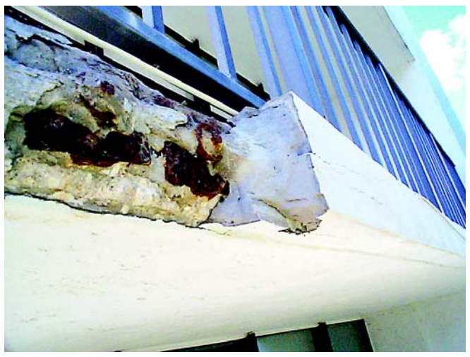
Improper slab edge repair that has failed (Note bursting bars and anchor are sandwiched between new mortar and old concrete)

In many cases, the answer to that question is yes. However, this is one of the most misunderstood and overlooked issues related to the inspection and repair of balcony slabs. What many often fail to recognize is how important the relationship is between the need to repair corrosiondamaged bursting bars at the slab edges and the