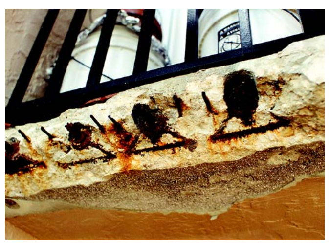
Close-up of balcony slab edge with spalled concrete exposing corroded bursting bars

More importantly, the owner can competitively negotiate with the prospective contractors for their lowest prices.