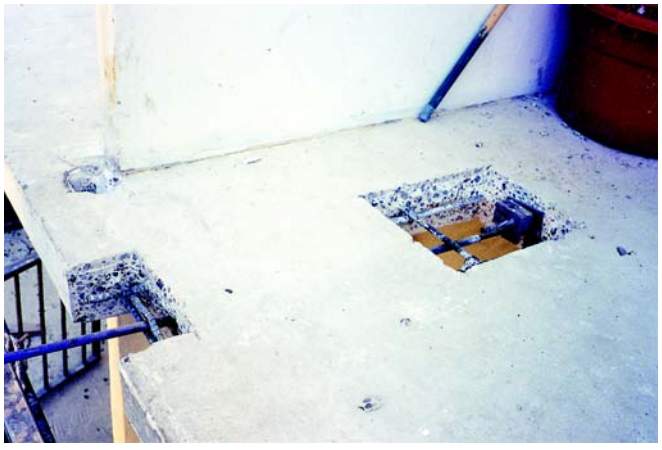
"Text book" repair of slab edge (Note the temporary lock off and slab edge with excavation per ICRI guidelines)

Experience has proven that successful posttensioned structural repair projects have several things in common. Most of these projects started with an owner and a structural engineer that recognized and acknowledged the significance of corrosion-related damage on the post-tensioned structure. This knowledge allows the structural engineer to investigate the structural damage and to account for its impact on the post-tension reinforcement. By documenting the full extent of all known scopes of repair work, the owner can adequately budget for the upcoming repair project.