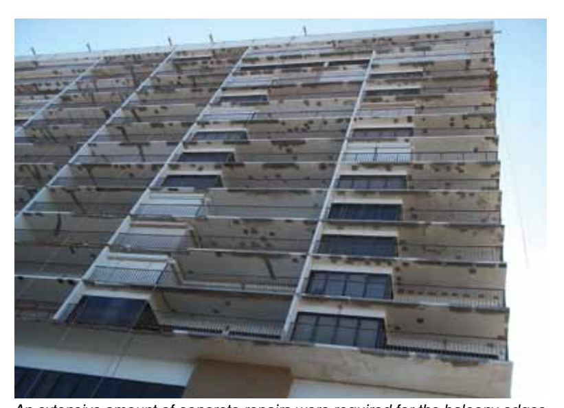
An extensive amount of concrete repairs were required for the balcony edges and soffits