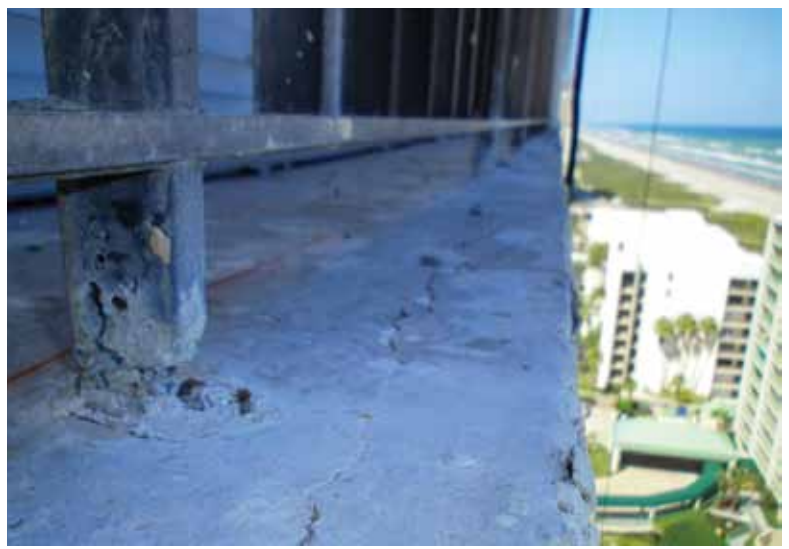
Deteriorated balcony slabs