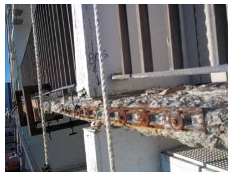
Corroded post-tensioned anchors

Work was conducted from 40 ft (12 m) swing stages. Because of the proximity to the Gulf,