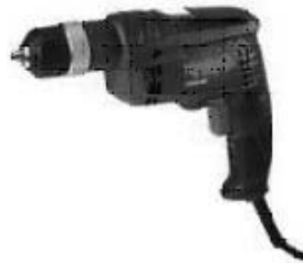
Type 1 light-duty high-speed pistol grip