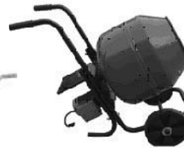
Type B tumble mortar mixer