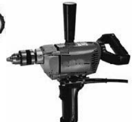
Type 3 heavy-duty D (or spade) handle with pipe handle