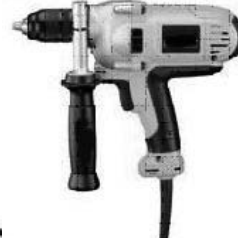
Type 2 heavy-duty pistol grip with rotating side handle