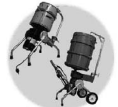
Type C rotating-drum, stationary-arm mortar mixer

concrete repair, such as shotcrete equipment, trowels, sprayers, and impact hammers, as well as additional examples of mixing paddles, drills, and mortar mixers.