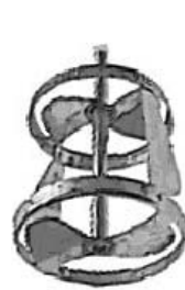
Drill mixing paddle #1

It is anticipated that future editions of this atlas will include other various equipment associated with the different materials and methods used for