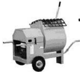
Type A horizontal shaft mortar mixer