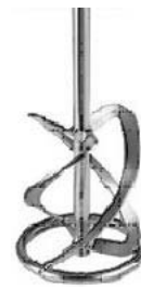
Drill mixing paddle #2