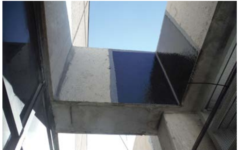
Fig. 5: CFRP fabric adds stability at beam intersection

In addition, a series of FRP repairs were made to repair and strengthen the building façade and the sunshade and outrigger beams. A unidirectional carbon fiber-reinforced polymer (CFRP) fabric was installed longitudinally along the flanges of the sunshade beams. A \pm 45 -degree, double-bias CFRP fabric was installed on both faces of the web to provide shear reinforcement and intersect the pre-existing cracks (Fig. 4). This same fabric was also used on the outrigger beams for added stability at the corners (Fig. 5). Once the FRP repairs were completed, an elastomeric, anti-carbonation coating was installed over the entire façade to provide protection against the elements and for improved aesthetics (Fig. 1).