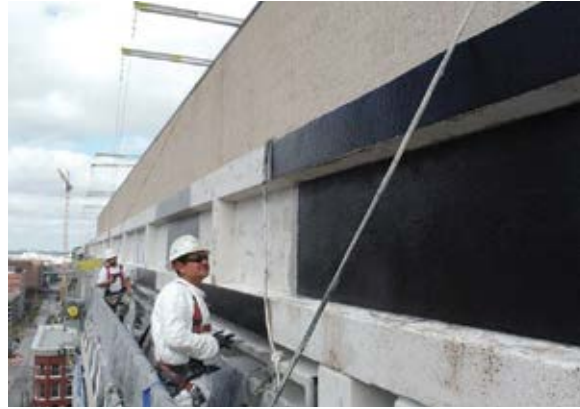
Fig. 4: Double-bias CFRP fabric installed on sunshade beams