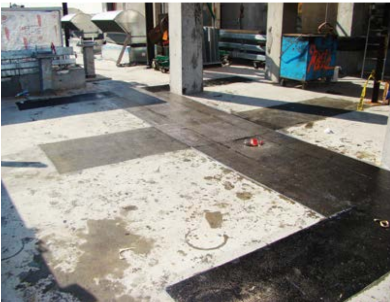
Fig. 14: CFRP fabrics bonded to roof slab to support additional loads

of structural elements (Fig. 13 and 14). FRP composites have been used successfully over the past three decades in the United States and abroad and have significantly replaced the traditional methods of adding new support beams or externally bonded steel plates or jackets. Not only do FRP composite materials offer higher strength than steel and concrete, they are extremely lightweight and noncorrosive, which provides for long-lasting repairs and sustainable structures. The industry has published design codes, guidelines, and approval criteria which enable structural engineers to safely determine which structures are candidates for FRP repairs and how to best design and detail a repair solution.