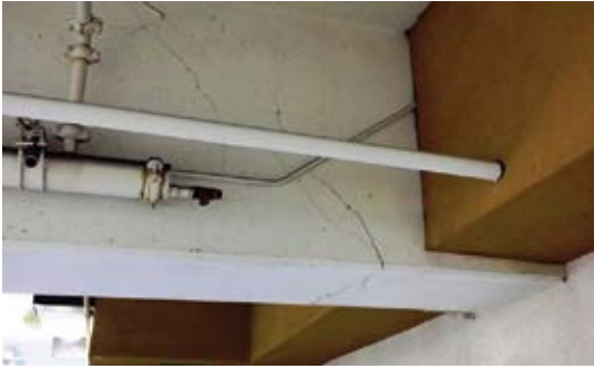
Fig. 11: Shear cracks in critical support beam

ally enhanced the opening and replaced the tensile forces that were removed when the existing reinforcing bar was cut out for the new opening. By placing the CFRP plates around the perimeter of the opening, the stresses were redistributed and the owner was able to install the new staircase without the need for a new structural beam. Not only was this a less-expensive repair option, but it was much less obtrusive to the client and the space.