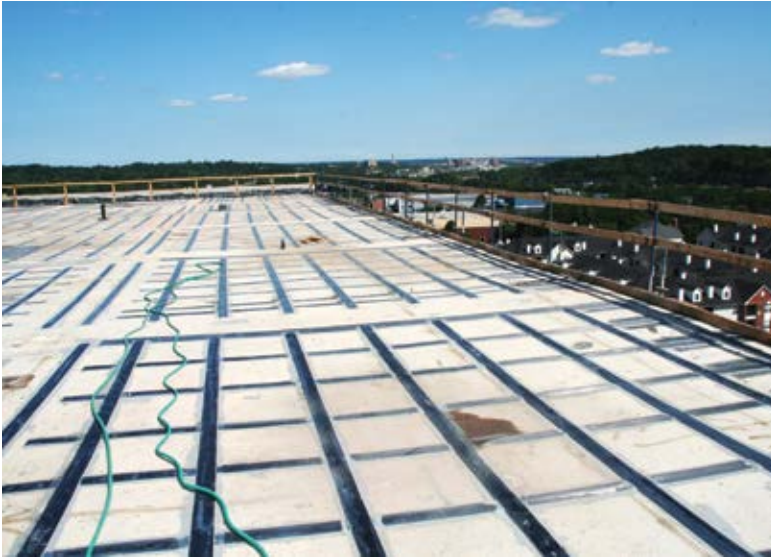
Fig. 7: Roof slab strengthened with CFRP laminates for blast hardening