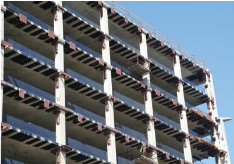
Fig. 8: Perimeter edge slabs strengthened with CFRP fabrics