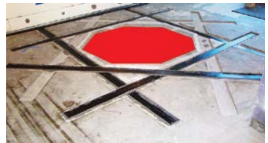
Fig. 10: Octagonal cut-out in slab reinforced with CFRP laminates

It is not uncommon for building owners to modify or alter their interior space over the life of the structure. This sometimes involves making cut-outs in the structural elements to accommodate these changes. However, whenever a reinforced concrete slab or wall is penetrated, this can change the load paths and possibly make the building unsafe. One way to reinforce the cut-out area is to add structural beams to carry the redistributed loads. While structurally sound, this solution is often undesirable because the new beams are difficult to install in an occupied space, impossible to hide, and take away from the functionality and aesthetics of the finished space. Another option is the use of externally bonded FRP plates, or in some instances, the use of near surface-mounted (NSM) carbon-fiber rods. For example, a condominium owner on Central Park West in New York City was combining two apartments into one and wanted to add a new octagonal shaped staircase into the units to allow direct access between the two units. Prior to saw cutting into the floor slab, a series of CRFP pre-cured plates were epoxy bonded into grooves cut into the concrete slab on both the top (Fig. 10) and bottom surfaces. The new CFRP laminates structur-