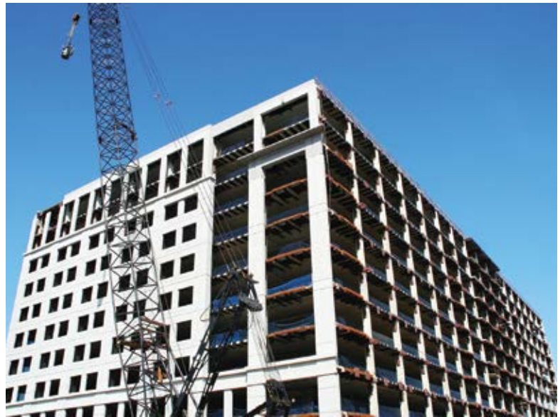
Fig. 6: New curtain wall installed over CFRP repairs at office building