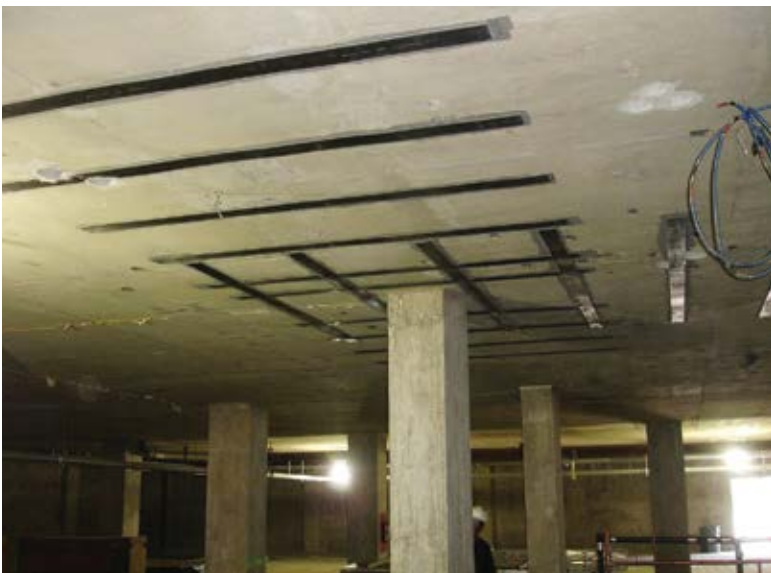
Fig. 9: Slab at column retrofitted with CFRP laminates to reinforce for punching shear

included demolition of the building core, building systems and building envelope. The entire façade was removed and replaced with a new precast concrete curtain wall (Fig. 6). A series of CFRP repairs were made during the renovation to structurally enhance the building and provide blast protection for future occupants.