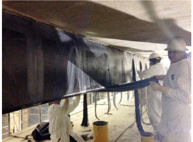
Fig. 12: Concrete beam wrapped with CFRP fabrics and "rope" anchors for seismic strengthening

One of the earliest uses of FRP composites in infrastructure applications was for seismically upgrading bridge structures, many of them built pre-1950s. The California Department of Transportation (Caltrans) initiated a program in the mid-1990s to evaluate and test advanced composite materials as a column wrap alternative to steel jacketing and pressure grouting. The lack of sufficient shear reinforcement and inadequate lap splice lengths created an unsafe condition for thousands of bridges on the West Coast in high-seismic regions.