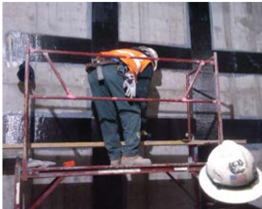
Fig. 13: Strengthening of foundation wall during original construction

FRP composites offer many advantages to owners, architects/engineers, and contractors for making modifications or alterations to building structures; undertaking upgrades for seismic, wind or blast loading conditions; as well as strengthening