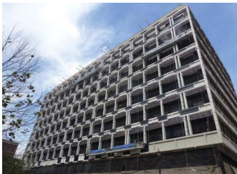
Fig. 1: Building façade repairs using CFRP fabrics

The International Concrete Repair Institute (ICRI) also has several documents on structural strengthening systems for concrete and masonry structures using FRP composites: ICRI 330.1, “Guide for the Selection of Strengthening Systems for Concrete Structures,” 8 and a Special Publication, “Strengthening and Stabilization of Concrete and Masonry Structures.” 9