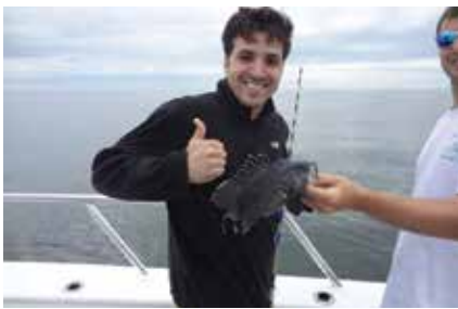
Well it's a nice little Sea Bass, but it's not in season yet