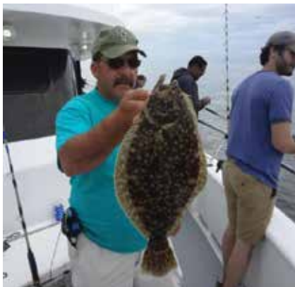
That's more like it!