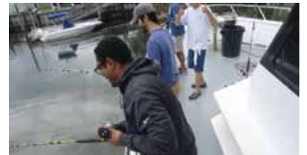
I think I got something