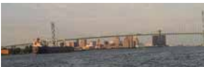
Approaching downtown Detroit

During the cruise the members and guests enjoyed a great dinner in the lower dining room, and then got to stretch their legs on the upper deck and enjoy the sights. Attendees were fortunate to pass alongside marvels you cannot see anywhere else. The boat cruised past three Great Lakes Freighters (Algowood, Michipicoten, and the John J. Boland), then past two salties (ocean-going cargo ships), the Iryda (from a Polish Steamship Company) and the Lisanna (from Antigua and Barbuda). During the return trip, the Chapter held its annual raffle to support its scholarship program. Prizes included gift cards to local stores and restaurants, a night stay at the Motor City Casino Hotel (thanks to Olympia Group), a set of ICRI Profile Chips, and a copy of the Concrete Repair Manual (thanks to ICRI). The weather couldn't have been better and the cruise and raffle were another success for the Michigan Chapter.