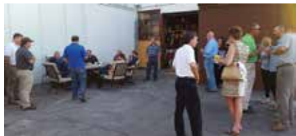
This chapter outing is planned as way to socialize and prepare for fall, although the weather was very summer-like