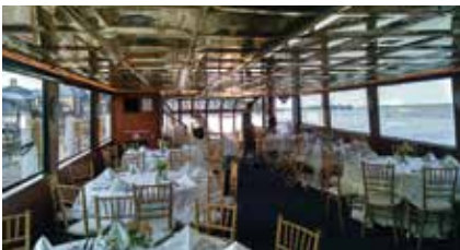
The lower level dining room was luxurious on the "Portofino"