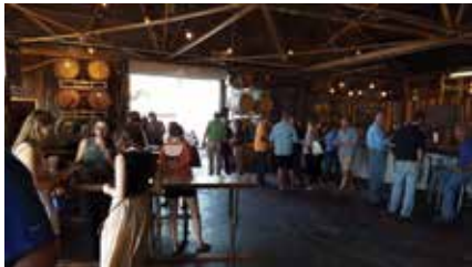
Georgia Chapter members and friends gathered at the Wild Heaven brewery for a summer social outing

This year's Georgia Chapter Fall Kick-off gathering saw participation at an all-time high. Since its inception, the