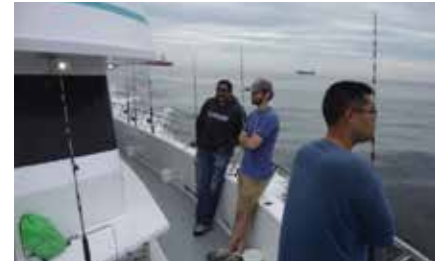
Well, where are the fish?