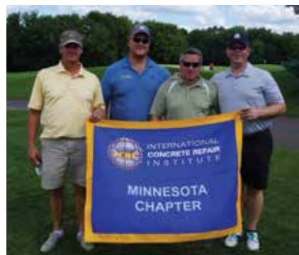
The winning team from BASF showing Minnesota Chapter pride!