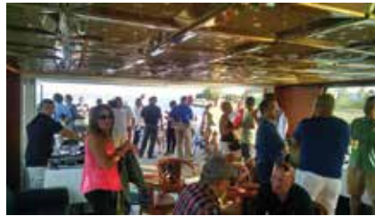
The upper level bar and deck were popular due to the perfect weather

During the cruise the members and guests enjoyed a great dinner in the lower dining room, and then got to stretch their legs on the upper deck and enjoy the sights. Attendees were fortunate to pass alongside marvels you cannot see anywhere else. The boat cruised past three Great Lakes Freighters (Algowood, Michipicoten, and the John J. Boland), then past two salties (ocean-going cargo ships), the Iryda (from a Polish Steamship Company) and the Lisanna (from Antigua and Barbuda). During the return trip, the Chapter held its annual raffle to support its scholarship program. Prizes included gift cards to local stores and restaurants, a night stay at the Motor City Casino Hotel (thanks to Olympia Group), a set of ICRI Profile Chips, and a copy of the Concrete Repair Manual (thanks to ICRI). The weather couldn't have been better and the cruise and raffle were another success for the Michigan Chapter.