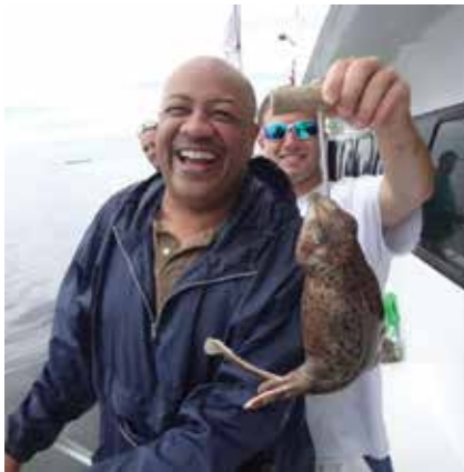
What the...? Looks like a Sea Hamster