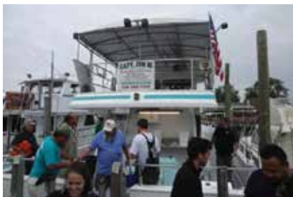
Man, you should have seen the one that got away