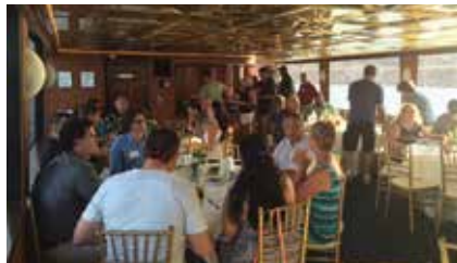
The buffet dinner was a big hit with all the members and guests of the Michigan Chapter