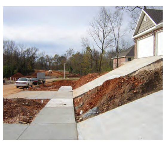
Fig. 1: A need for proper specifications

Starting in 2004, under the leadership of the Strategic Development Council (SDC) of the ACI Foundation, Vision 2020 was developed for the concrete repair, protection, and strengthening industry. ICRI is an endorsing organization of the Vision 2020 document.<sup>2</sup> The mission of Vision 2020 is to provide a strategic plan for improvements in the concrete repair industry, making the industry more efficient, effective, green, safe, and fun by year 2020. Thirteen goals were identified, including Goal 4 to create repair specifications that support a repair code. The ACI 562 Repair Code<sup>3</sup> was published in 2013. Two committees were formed to provide repair specifications: ACI Committee 563, Specifications for Repair of Structural Concrete in Buildings, to develop performance-based repair specifications; and ICRI Committee 110, Guide Specifications, to develop installation guide specifications. In 2006, ICRI Committee 110 began addressing the need for guide specifications.